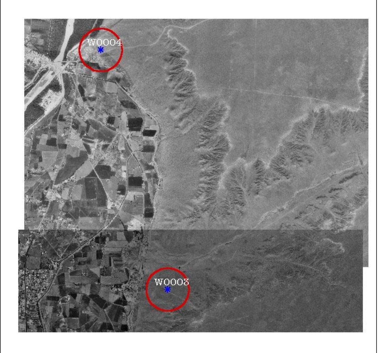
Figure 1: Isleta Pueblo/Eastside