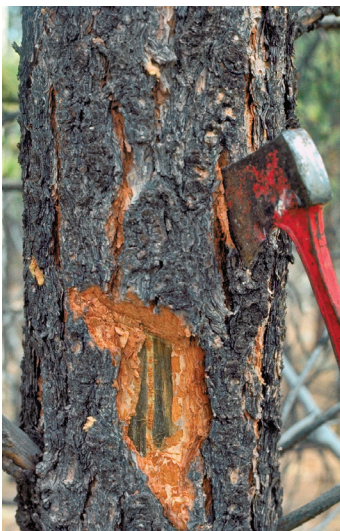
Figure 7: Checking beneath the bark for MPB. This attack was successful (note tunnels and stain).