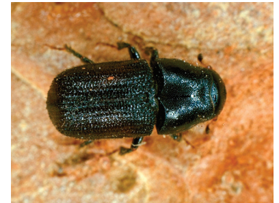
Figure 3: Top view of adult MPB (actual size, 1/8 to 1/3 inch).

Mountain pine beetle has a one-year life cycle in Colorado. In late summer, adults leave the dead, yellow- to red-needled trees in which they developed. In general, females seek out large diameter, living, green trees that they attack by tunneling under the bark. However, under epidemic or outbreak conditions, small diameter trees may also be infested. Coordinated mass attacks by many beetles are common. If successful, each beetle pair mates, forms a vertical tunnel (egg gallery) under the bark and produces about 75 eggs. Following egg hatch, larvae (grubs) tunnel away from the egg gallery, producing a characteristic feeding pattern.