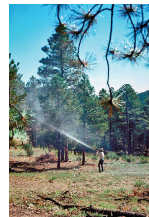
Figure 10: Large, uninfested pine being preventively sprayed. This protects high-value trees and should be done annually between April 1 and July 1.