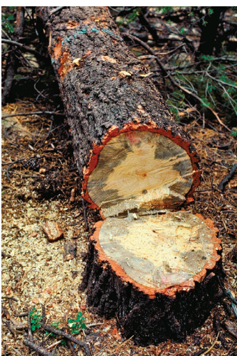
Figure 9: Cut tree killed by MPB, showing the characteristic blue-staining pattern.