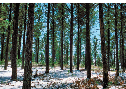
Figure 11: The appearance of a forest thinned to help prevent MPB. This can also improve mountain views and reduce fire hazard.

pine beetle, leading to early reports that “MPB is flying.” Be sure to properly identify the beetles you find associated with your trees.