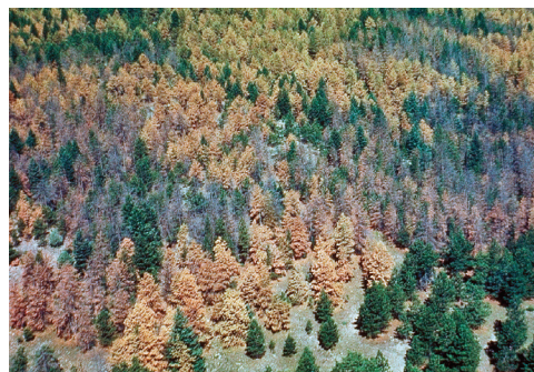
Figure 4: Mountain area infested by MPB, showing three years of mortality. Old, dead trees are gray; newly killed trees are straw yellow or orange. Some trees may also be infested but do not turn color until nine months or so under attack.

MPB larvae spend the winter under the bark. Larvae are able to survive the winter by metabolizing an alcohol called glycerol that acts as an antifreeze. They continue to feed in the spring and transform into pupae in June and July. Emergence of new adults can begin in mid-June and continue through September. However, the great majority of beetles exit trees