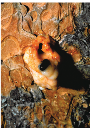
Figure 6: Not all pitch tubes indicate successful attacks. Note the beetle trapped in this large pitch tube. If the majority of tubes look like this, the tree may have survived the current year's attack.