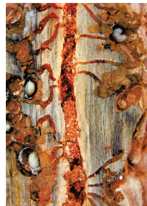
Figure 8: Characteristic tunnels (galleries) of mountain pine beetle made by the adults and larvae. The underbark area looks like this in late spring. Bluestained wood is caused by fungi the beetles introduce.

An important method of prevention involves forest management. In general, MPB prefers forests that are old and dense. Managing the forest by