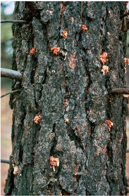
Figure 2: "Pitch tubes" indicating trunk attacks by MPB. Success of the attacks is confirmed by looking under the bark with a hatchet for beetles, their tunnels and/or bluestaining.