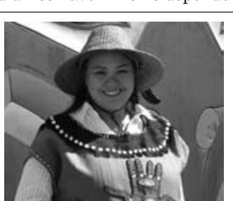
This mother dons Tlingit tribal regalia to show her support for raising tobacco-free children—a tribal tradition that is important in Sitka, Alaska.

the same way other medical treatments, such as those for hypertension, are reimbursed."