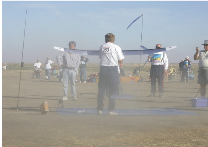
FIGURE 1. Persons attending the world championship of model airplane flying — Lost Hills, California, October 2001