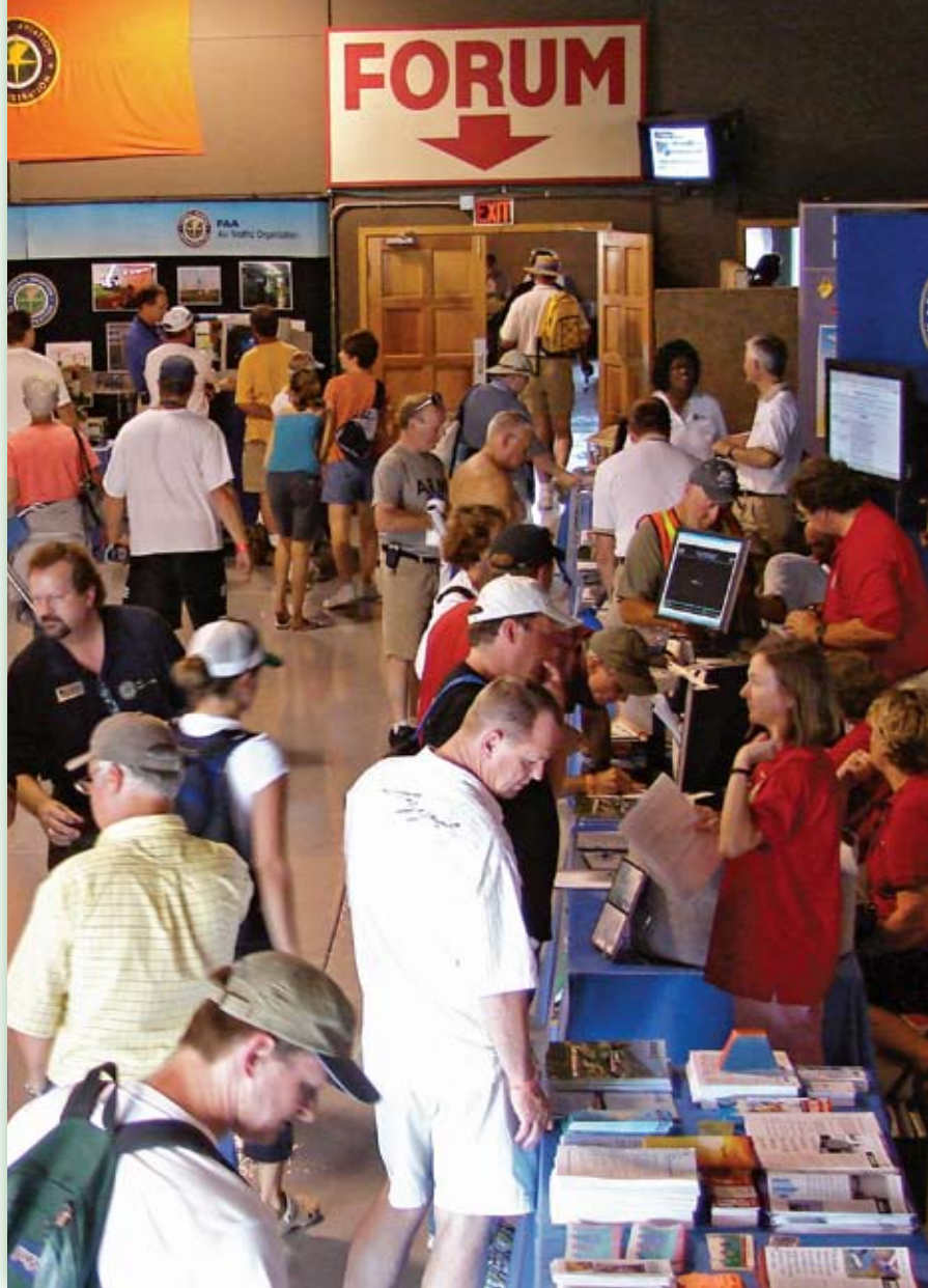
Visitors check out the many displays in the FAA Exhibit Hall.

Staffing efforts start around December, when interested controllers from the Air Traffic Organization’s (ATO) Central Service Area bid for one of the 64 slots available. “We’re working O’Hare-level traffic with pilots whose experience is all over the map, so we’re looking for the best of the best,” says Adelman. The application process requires various recommendations and experience counts, too. The team tries to select half of the controllers from the “veteran” category, which requires at least three years of AirVenture experi-