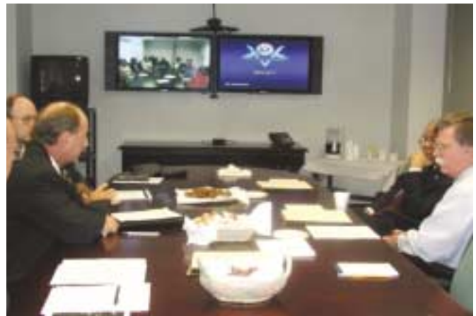
Secretary Powell, top right, checks out secure system.

The video conferencing equipment uses the Department's ClassNet network to connect users. The system also allows you to hold videoconferences with select Defense Department sites. Encrypted phone lines are also planned. The system can currently connect up to 12 participants at once in approved conference rooms at