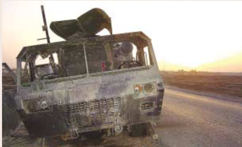
A burned out vehicle on the road from Talil Air Base to Nasiriyah.

the British military came over to work with local engineers. We joined them for a trip to the power plant to see how things were going. Soon we were looking over blueprints and listening to plans to restore power to neighboring cities. Our tour through the plant created quite a bit of excitement. Within half an hour, some two dozen co-workers appeared in the control room where we were filming. A young Iraqi engineer approached me to explain how the turbines worked and the capacity of the plant. The station manager proudly explained that the power plant was the only public facility spared from looting, thanks to loyal employees.