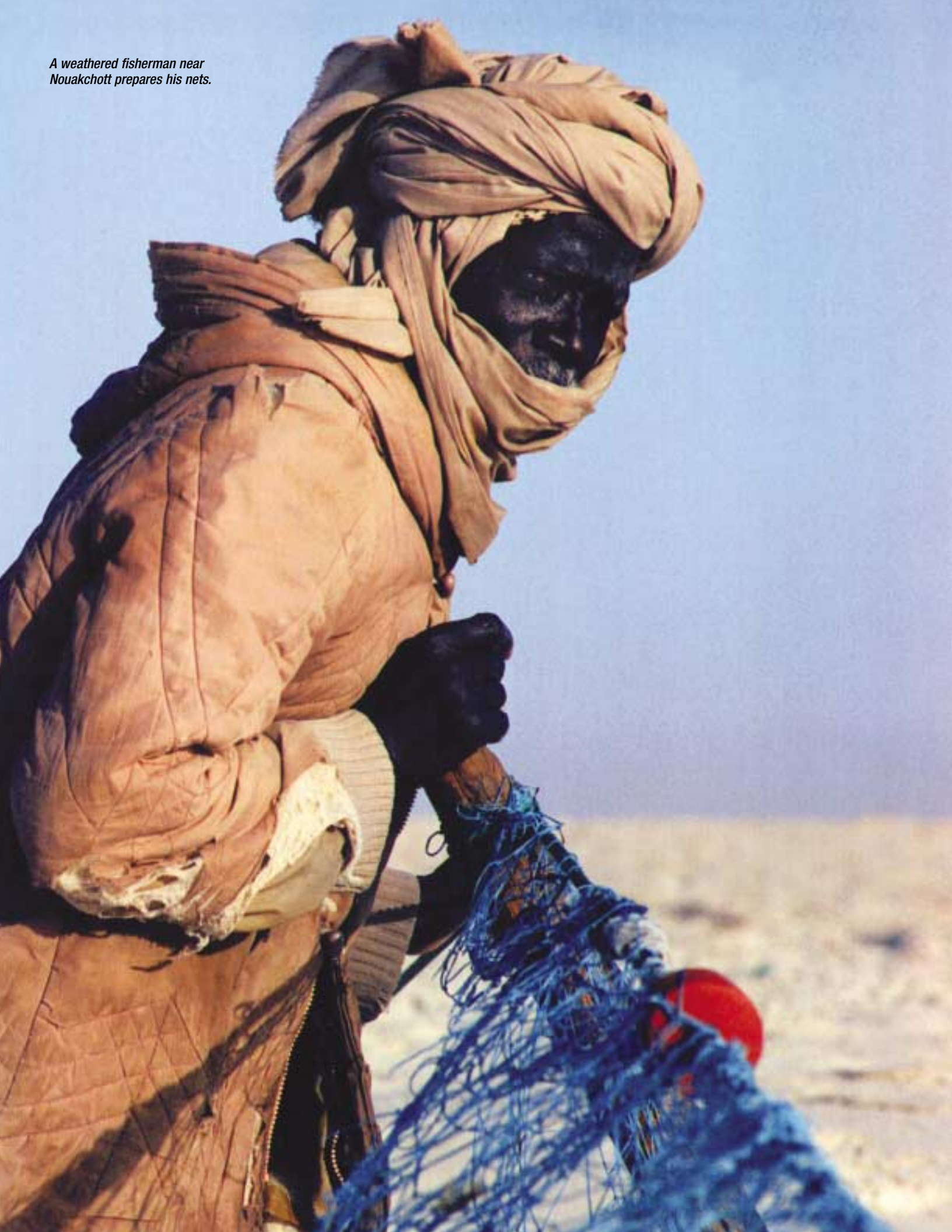
A weathered fisherman near Nouakchott prepares his nets.