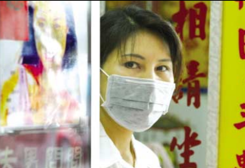
A masked fortune teller cautiously waits for customers at the height of the SARS scare.

The author is the regional medical officer for China and Mongolia.