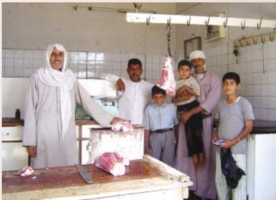
Left: A woman shops at a market in Umm Qasr. Above: A Basrah butcher and his helpers.

Our first stop was a military installation in the town of Nasiriyah where U.S. forces had converted a community college into an operations center. The public affairs officer and I left the crew behind with the car and ventured into the compound. A few soldiers lounged in the salvaged desks scattered near the front entrance. We walked through the courtyard into a dim hallway. Already the camp was in action. Officers with access to computers had systems up and running. Different company commanders were briefing their soldiers.