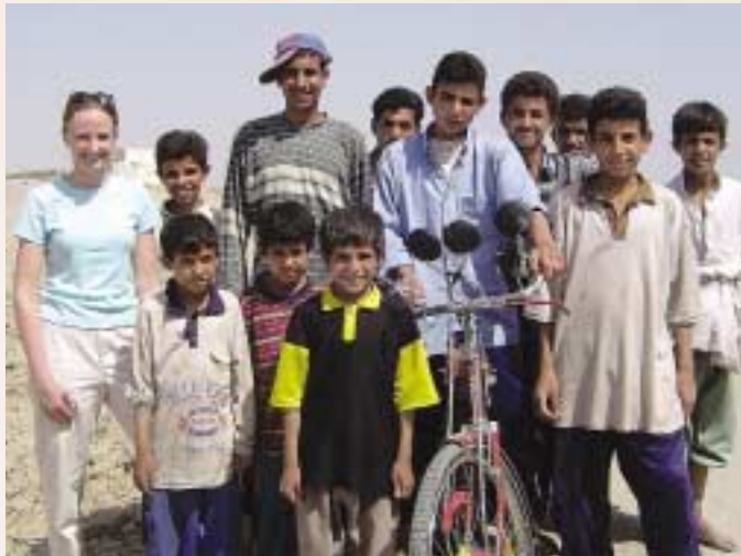
The author with children and teens on outskirts of Nasiriyah.

Luckily for us, a British colonel offered to let us follow his Land Rover back to Basra. He assured us that southern Iraq was much safer than we imagined and that we would have no problems navigating city to city. I left my freelance photographers in the cool cabin of the Suburban and joined the colonel, his driver and media