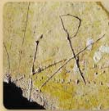
Top: A menorah. Above: A monogrammic cross.