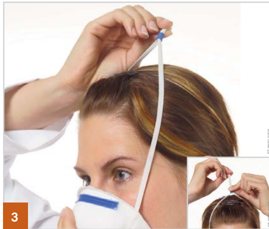
3 Pull the longer strap into position at the back of your head. Slide the adjustment knob toward your head for an optimal fit.