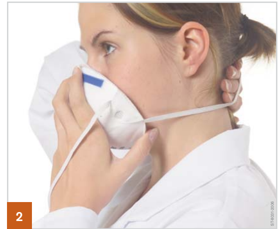
2 Position the mask under your chin and over your nose and slip the short strap over your head to the back of your neck.