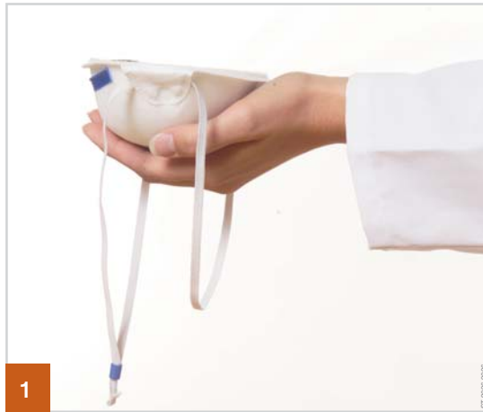
1 Hold the mask in your hand with the head straps hanging down.