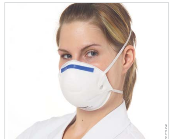
Ready for use.