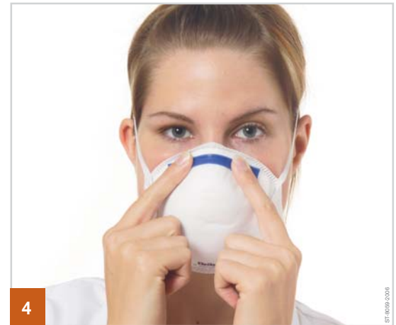
4 Adjust the nose clip to minimize leakage.