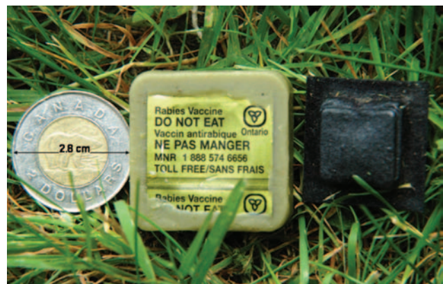
Figure 2. Evelyn-Rokitnicki-Abelseth rabies vaccine bait, showing the vaccine container (normally embedded in the matrix of the bait) to the right of the bait.

Metropolitan Toronto is connected to rural areas through a series of ravine systems dominated primarily by deciduous trees. These ravines provide a travel corridor through which wildlife, including red foxes, moves into and out of metropolitan Toronto (11). The ground and aerial distribution of rabies vaccine bait in metropolitan and greater metropolitan Toronto, which resulted in immunization of a substantial portion of the fox population against rabies, eliminated rabies from that urban complex. Aerial baiting in rural habitats surrounding metropolitan Toronto, as well as greater metropolitan Toronto, after 1995 may have contributed to rabies control in metropolitan Toronto, as few rabid foxes have been available to disperse rabies into that urban complex. As well, one cannot discount the effect that the trap-vaccinate-release programs in Scarborough had on the control of rabies in metropolitan Toronto. However, the trap-vaccinate-release program targeted raccoons and skunks as opposed to foxes (9). Greater