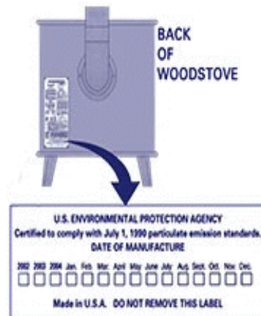
Permanent Wood Stove Label

Wood stoves offered for sale in the state of Washington must meet a particulate emissions limit of 4.5 grams per hour for non catalytic wood stoves and 2.5 grams per hour for catalytic wood stoves.