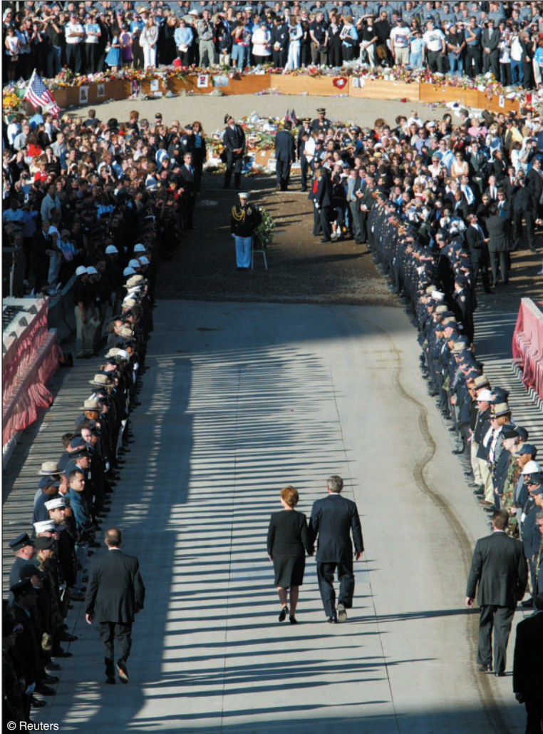
President George W. Bush and First Lady Laura Bush walk past an honor guard as they proceed into the pit at the site of the World Trade Center in New York, 11 September 2002.

September 11 is preventing attacks, saving lives, and exposing the hiding places of terrorists.