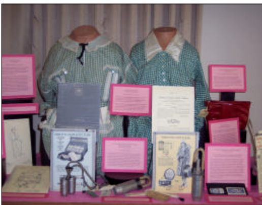
The Fashion Court exhibit examined several court cases concerning the fashion and beauty industry. All of the documents and artifacts exhibited are from the National Archives-Central Plains Region.

The Central Plains Region offers small, temporary exhibits in the lobby area. Exhibits use facsimile copies of original records held by the region in order to protect the original documents from harmful ultraviolet light. All of our exhibits are designed to educate visitors about the records we hold and how they may be of use to them. Exhibits are changed every two to three months and focus on a variety of topics. Call (816) 268-8071 for the exhibit schedule.