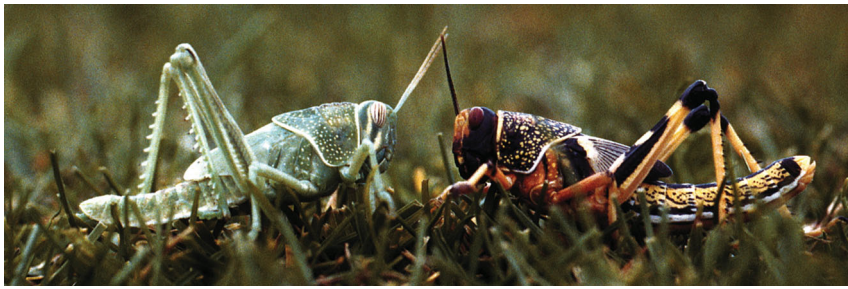
Figure 1. Nymphs of Schistocerca gregaria , solitary phase on the left and gregarious phase on the right.