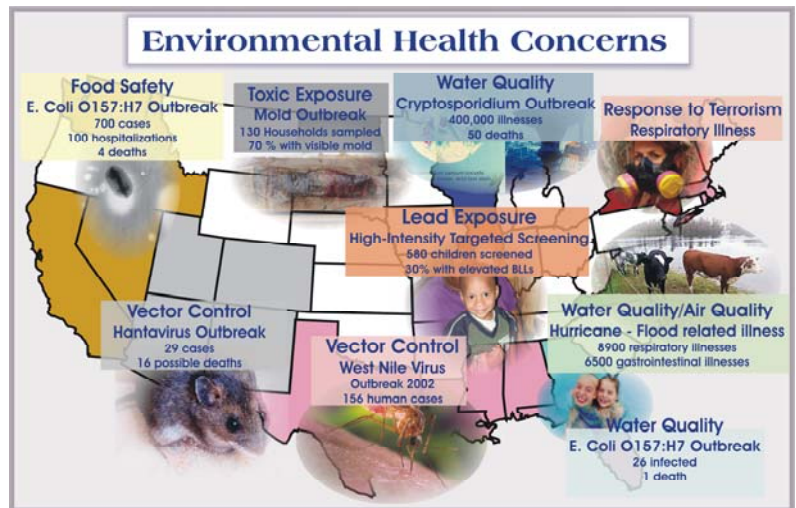
Environmental Health Services Are Needed Throughout the United States to Address Environmentally Related Public Health Events

In November 2000, the Department of Health and Human Services published objectives for improving the nation's health, Healthy People 2010. It stated that: "various reports and evaluations have described the continuing deterioration of the national public health system; health departments are closing, technology and information systems are outmoded, emerging and drug-resistant diseases threaten to overwhelm resources, and serious training inadequacies weaken the capacity of the public health workforce to address new threats and adapt to changes in the health care market," and "all public health services depend on the presence of basic infrastructure."