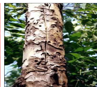
Dead tree due to ALB attack