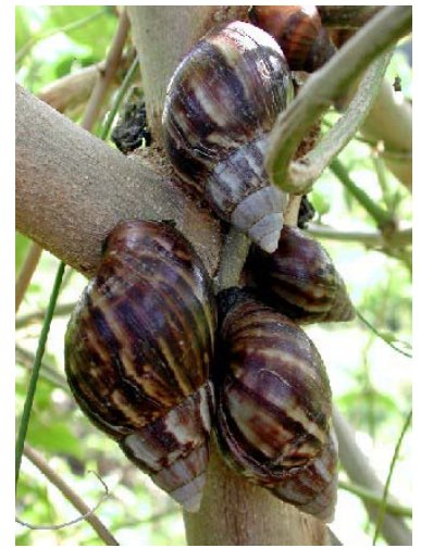
African snail attack

throughout the Indo-Pacific basin, including the Hawaiian Islands. In the Asia-Pacific region, it is known to occur in India, Sri Lanka, Bangladesh, Malaysia, Taiwan, Vietnam, Indonesia, Timor, Thailand, Japan, Hong Kong, China, Papua New Guinea, Australia (Queensland), Vanuatu and American and Western Samoa. The spread of giant African snail is likely to be due to illegal importation by exotic animal dealers. The giant African snail, being non-host specific, is reported to cause economic damage to a wide variety of crop plants and plants of horticultural and medicinal importance. The snail may also carry a parasite that can infect people. It is recommended that countries monitor against the introduction of giant African snail. Discoveries of new snail incursions should be reported to the appropriate authorities .