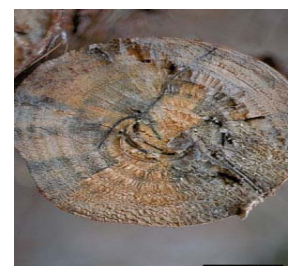
Ambrosia wood damage