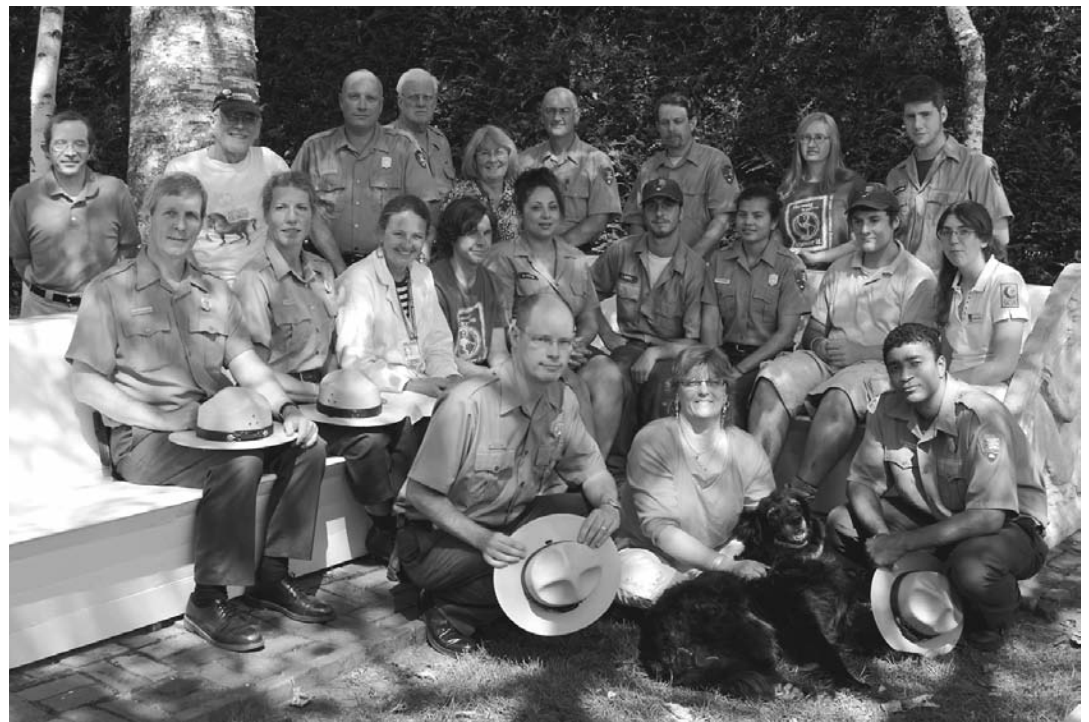
2006 permanent and seasonal staff and Student Conservation Association volunteers.

Each year a very popular series of sculpture classes, co-sponsored by the site and the Friends of Saint-Gaudens are taught by the site's Sculptor-in-Residence. Workshops include beginner to advanced classes, rubber and plaster mold making, plaster casting and patination. Last year's classes had waiting lists, so sign up early. For more information see our website or call the park for details.