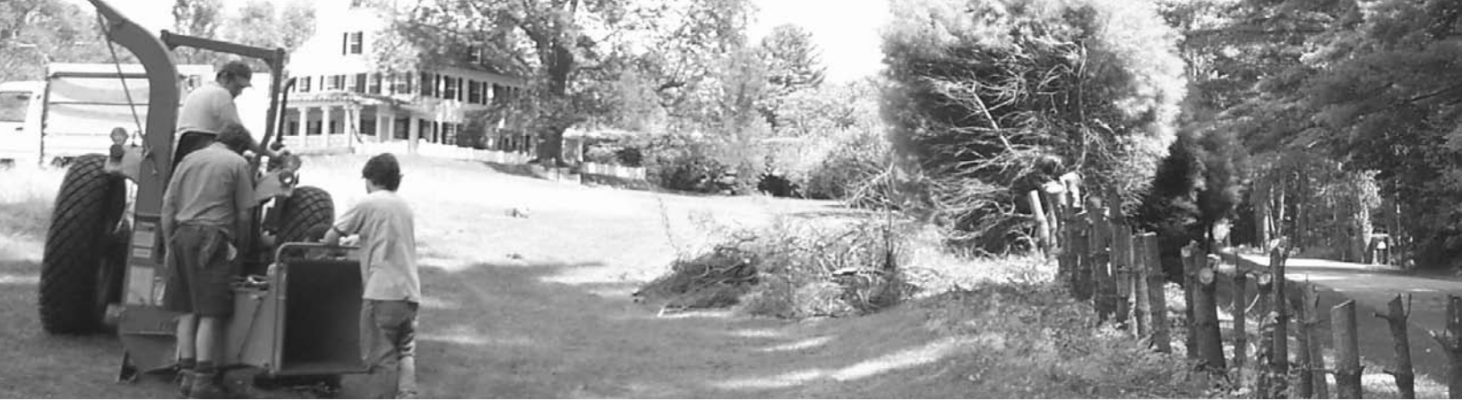
Hedge removal / replacement project in progress.