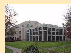
DSL's Salem Office

How to use this map: The blue lines and each eight digit number (e.g. 17080002) each represents a Fourth Field HUC watersheds, and the green lines and two digit numbers (e.g., 01) each represents a Fifth Field HUC watershed. For example: 1708002 (a fourth field HUC watershed) with a suffix of 01, refers to a Fifth Field HUC watershed having a identifying number of 1708000201.