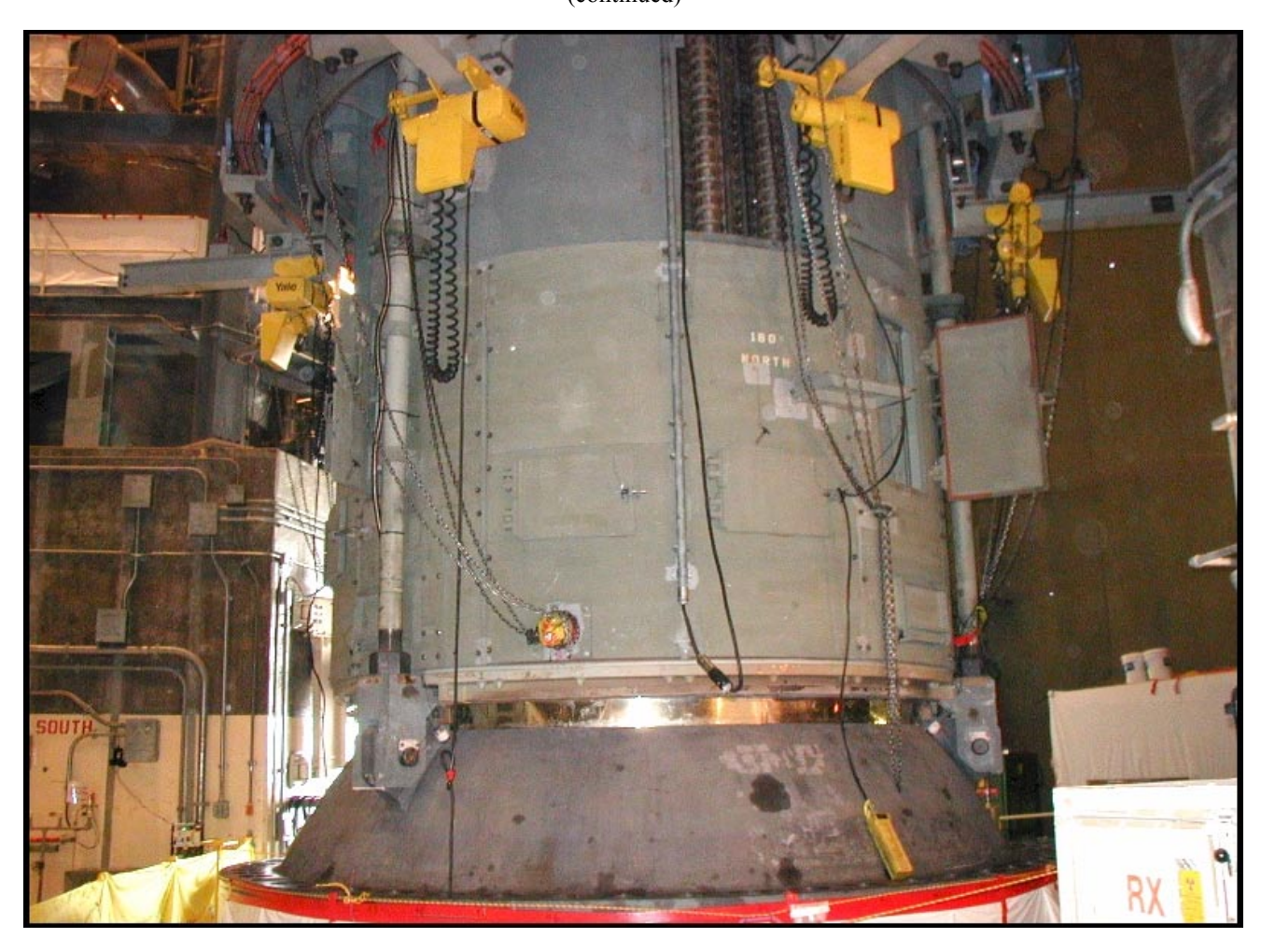
FIGURE 5 – VOGTLE INTEGRATED RPV CLOSURE HEAD PACKAGE (LOWER PORTION)