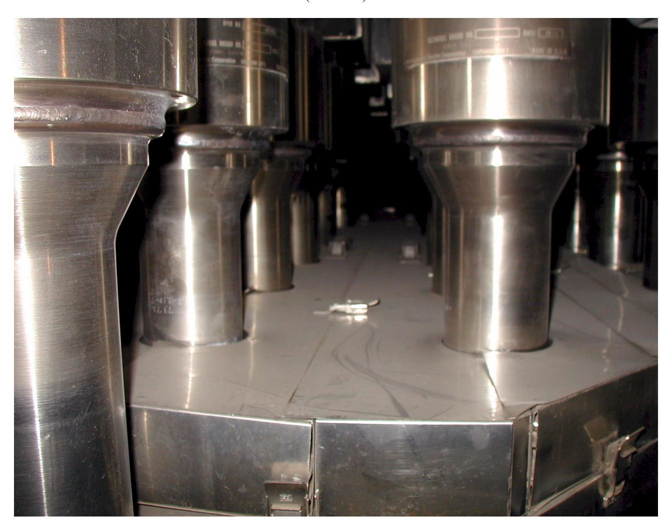
FIGURE 2 – RPV CLOSURE HEAD INSULATION AROUND CRDM NOZZLES