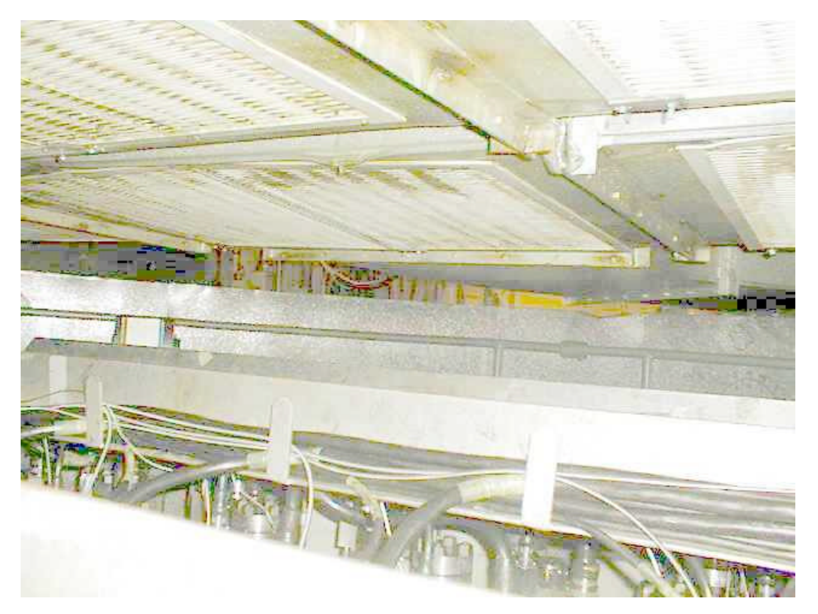
Attachment 2: Area Beneath Missile Shield