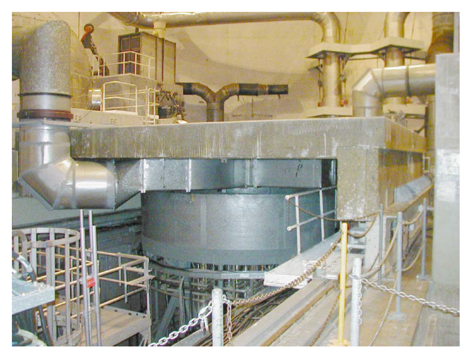
Attachment 2: Installed Missile Shield