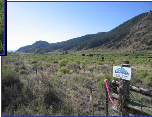
Along the East Fork of the Upper Sevier River.