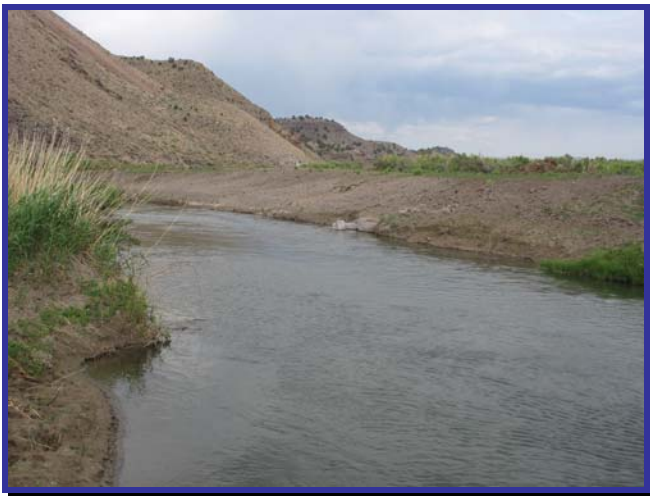
Riparian restoration site along the Upper Sevier River.