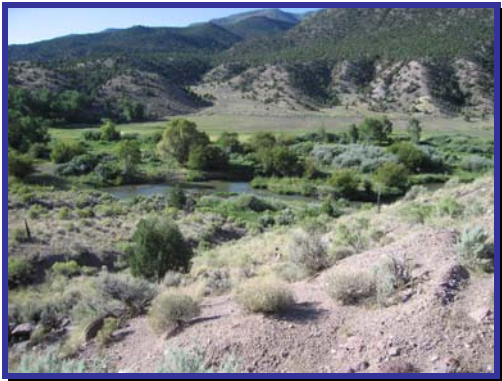
East Fork of the Upper Sevier River.