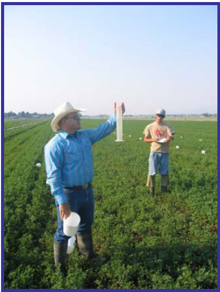
Reading catch cups.