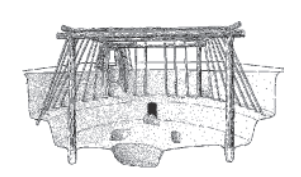
Cross-section of a pithouse

During this period, settlements ranged from five to fifteen deep pithouses with wall niches, floor pits, and entry ramps. It appeared to have been a stressful period, with a major drought from A.D. 850 to 900. Artisans began to decorate their pottery with painted designs.