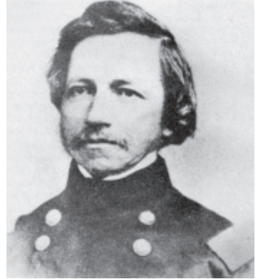
Lt. Amiel Weeks Whipple

December 2—Camp 76...Quite a forest of petrified trees was discovered to-day...They are converted into beautiful specimens of variegated jasper. One trunk was measured ten feet in diameter, and more than one hundred feet in length.... ~~ Lieutenant Amiel Weeks Whipple, 1853