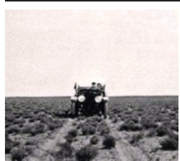
National Old Trails Highway

While traveling through the park, you will see a bridge arching over a long stretch of railroad. The Atlantic and Pacific Railroad laid lines in this region in the early 1880s, sparking the founding of many northern Arizona towns, including Holbrook to the west. Adamana was the nearest town attached to what was then called the Chalcedony Forest, providing a train station, hotels, and tours. The Atchison, Topeka and Santa Fe Railway took over the line, eventually becoming today's Burlington Northern and Santa Fe Railway. While the heyday of tourist travel by train is gone, still more than sixty trains a day pass through the park.