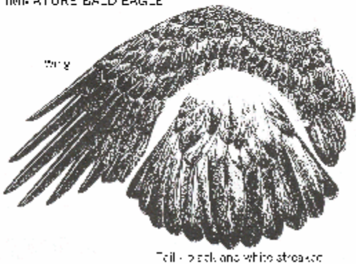
IMMATURE BALD EAGLE