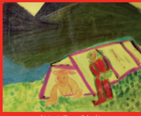
Living in Tents - Colombia