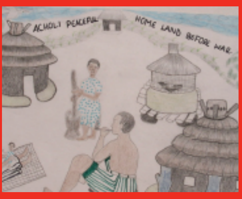
Peace - Uganda