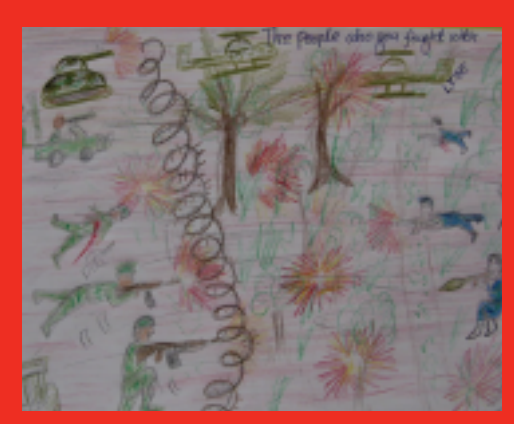
Fighting for Liberation Tigers of Tamil Eelam (LTTE) - Sri Lanka