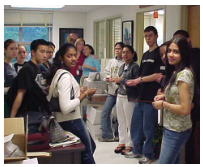
Club members observe a moment of silence

Every time the Advocates for Children in the Crossfire Club meets we have a moment of silence and light candles for each of the international youth that taught us so much. We don't want to forget them and we want to make sure that other people know about them also.