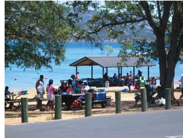
Acorn Beach Shade Shelter

Acorn Beach has group picnic sites with shade shelters for large groups or special events. For reservations of a group site for parties of 25 or more, call the Reclamation office at 707-966-2111.