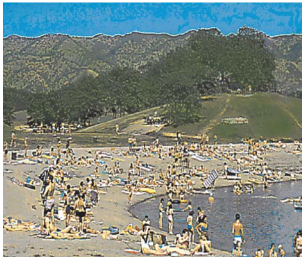
Swimmers at Coyote Beach

Coyote Beach and Acorn Beach are two areas ideal for children and families. The sandy beaches offer areas which are closed to personal watercraft and boats. Picnic tables, grills, and restrooms are nearby.