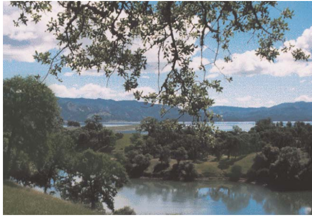
Oak Shores Day Use Area

Welcome to Oak Shores and Smittle Creek. Constructed and maintained by the Bureau of Reclamation to blend in with the surrounding environment, Oak Shores and Smittle Creek are home to an abundance of wildlife. The area offers day-users a variety of recreational opportunities year round including fishing, wildlife viewing, beach activities, swimming, hiking, and picnicking.