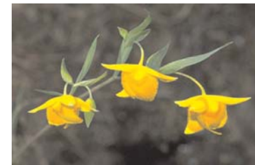
Golden Fairy Lantern

Stroll Smittle Creek Trail to see wild flowers, birds, and wonderful lake views. The trail wanders along the shore between Coyote Knolls and Smittle Creek. The walk is 5.2 miles round trip and offers the hiker a chance to view the natural flora and fauna of the area.