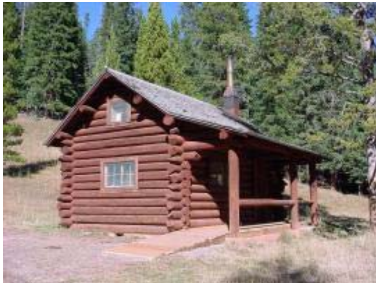
Window Rock Cabin, Bozeman Ranger District