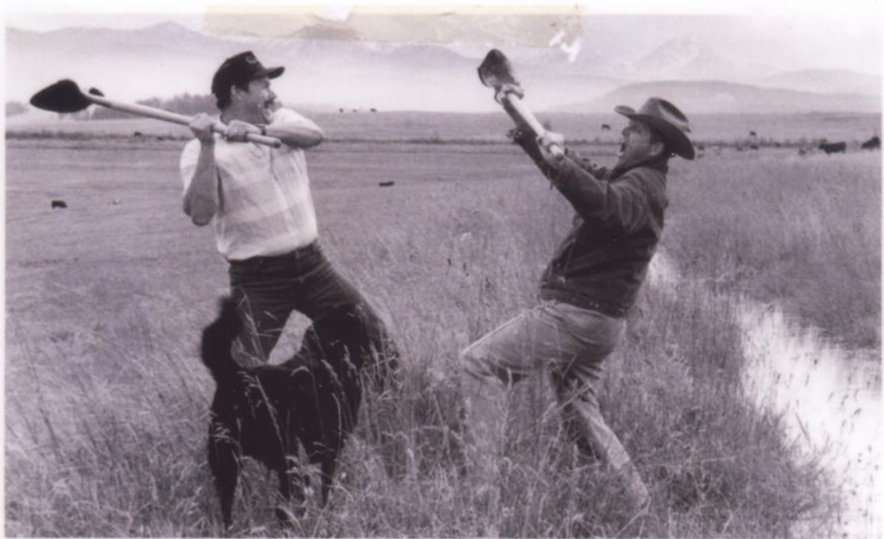
Discussing Water Rights, A Western Pastime