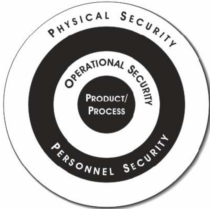
Figure 1. Target-Barrier Concept Displaying Multiple Layers of Security. Critical processing steps should employ the most layers of security. (Adapted from Department of Energy 1996)