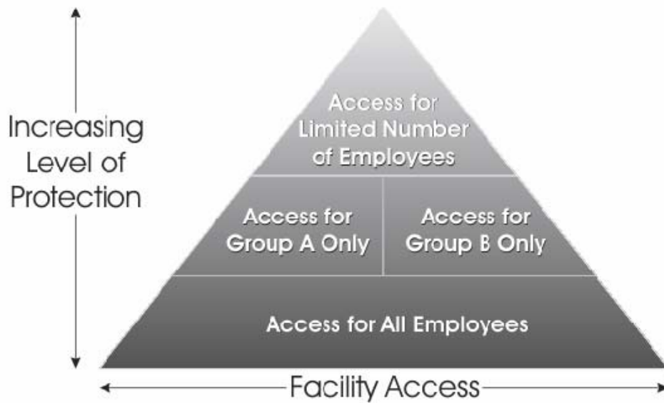
Figure 2. Example of varying employee access levels by sensitivity of the operation. Areas containing the most vulnerable operations should be restricted to a limited number of employees, and these employees should receive background investigations and additional training.