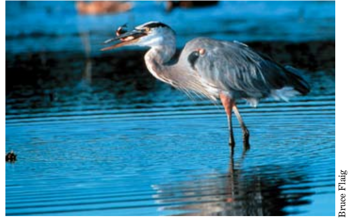
Great blue heron.

Native Americans named the Concord River "Musketahquid," meaning grassy banks. Settlers named the grasslands the "Great River Meadows." Hay was harvested annually and provided an important income for early settlers. With the advent of industrialization in the early 19th century, a mill dam was built in Billerica. The dam caused the river's water level to rise and to extend into the Meadows. The newly created habitat became increasingly attractive to waterfowl. In fact, the wetlands became highly valued for hunting and fishing.