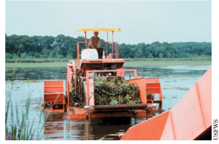
Aquatic weed harvester at work.

A great diversity of birds have been recorded at Great Meadows NWR: an annotated list of over 220 species is available in a separate brochure. White-tailed deer, beaver, fisher, otter, muskrats, red fox, weasels, and various small mammals all find a home in the refuge's rivers, wetlands, fields and woods. Amphibians and reptiles can be observed in the warmer months, but no poisonous snakes are found on the refuge. Several species of waterfowl, including mallards, black ducks, wood ducks, and blue-winged teal nest here. Nesting boxes are provided for wood ducks in some refuge wetlands.