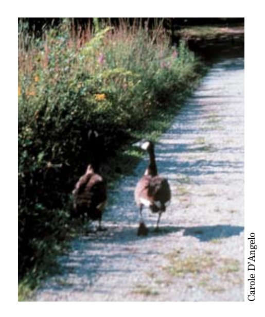
Canada Geese on trails.

In 2000, a new trail and parking area were added to the refuge through cooperative efforts with the Sudbury Valley Trustees. The parking area is located on the east side of the Route 4 bridge in Billerica. Hikers will eventually be able to follow this river trail to Two Brothers Rock in Bedford.