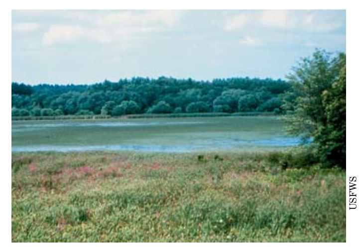
Sudbury River; Weir Hill Area.

Teachers and other group leaders may receive assistance in using the refuge as an educational resource. Teachers can lead visits that will enable their students or groups to learn directly about the natural world by studying wildlife habitat and observing wildlife.