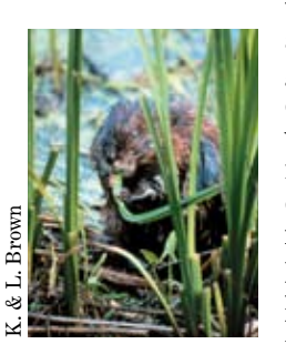
Muskrat assisting in management on the refuge.

One of the major wildlife management efforts underway at Great Meadows NWR is the control of exotic plants. Plants such as purple loosestrife (the tall purple flower seen in disturbed areas) and water chestnut (the small green plant that forms a carpet over open water) have little to no wildlife value and are out-competing our native vegetation. Several methods of control have been attempted at the refuge: everything from hand-pulling plants, to chemical applications, to flooding the marshes. For purple loosestrife, the release of weevils and beetles native to the European home of loosestrife, seems to be the best management solution. These insects feed only on purple loosestrife.