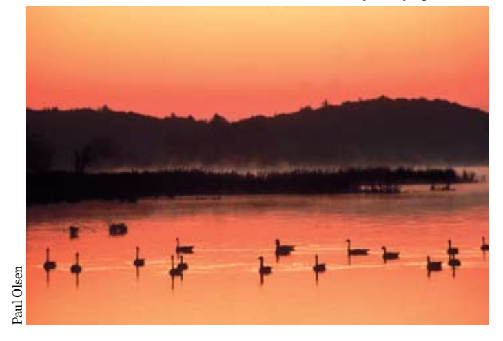
Sunset at Great Meadows National Wildlife Refuge

Great Meadows NWR is one of eight national wildlife refuges that comprises the Eastern Massachusetts National Wildlife Refuge Complex. The eight ecologically diverse refuges include Assabet River, Great Meadows, Mashpee, Monomoy, Nantucket, Nomans Land Island, and Oxbow. Protected inland and coastal wetlands, forests, grasslands, and barrier beaches provide important habitat for migratory birds, mammals, plants, reptiles, and amphibians.