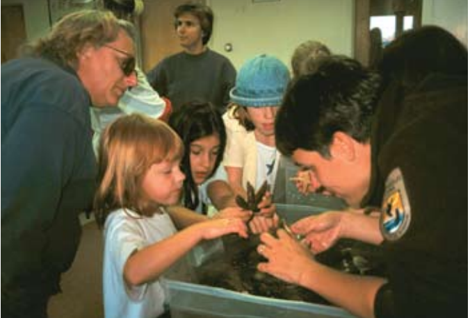
Nature study with kids and staff.

Travel to this area by following Route 62 east from Concord Center toward Bedford. After about one mile, turn left onto Monsen Road. Continue on Monsen Road until you see the refuge entrance on your left.