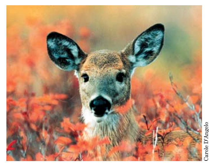
White-tailed deer in fall.