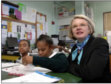
Secretary Spellings visits a classroom at St. Peter Claver School in New Orleans, Louisiana.

As part of her national tour to discuss NCLB, Secretary Spellings traveled to Alabama where Governor Bob Riley hosted an education policy roundtable with state legislators, educators, and business leaders at the Alabama State House in Montgomery to discuss how the federal government can partner with the state and districts to support innovation and get every child performing on grade level or better. She also kicked off Black History Month by participating in a meeting with African American leaders at a roundtable meeting hosted by 100 Black Men of America to discuss raising student achievement. (Feb. 1)