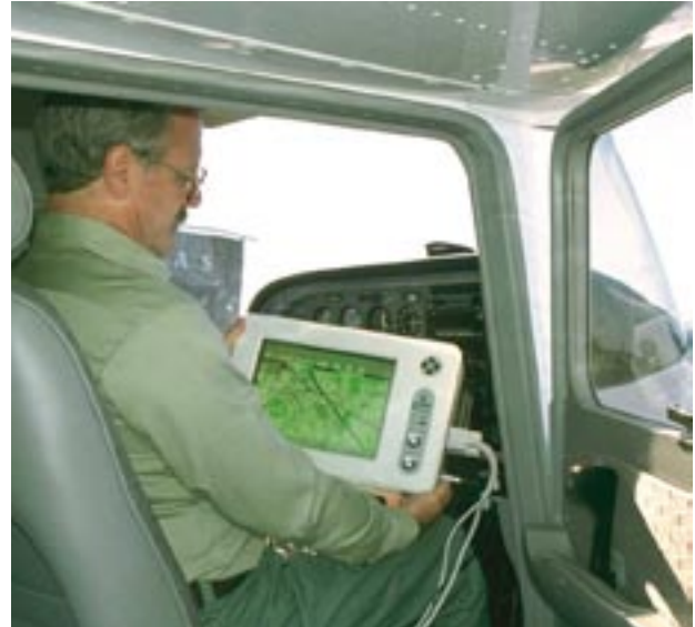
Digital Aerial Sketchmapping System in single-engine Cessna aircraft

The Digital Aerial Sketchmapping System runs on a laptop computer which is connected to a sunlight readable touch screen display. The display acts as the input device both for issuing commands to the system through buttons and drop-down menus, and for sketching and attributing features. Features can be points, lines or polygons, and attributed through user-definable keypads with data such as the damage causing insect, host species, and severity of damage. The background map displayed on the screen can be any geo-referenced map base or imagery. The position of the aircraft is shown on the screen, and the current aircraft position and map base are refreshed based on input from a GPS unit attached to the system. Data files created during a survey flight are easily exported to ArcView® shape files.