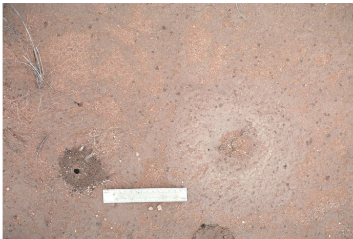
Left: Active ant mound. Right: Old ant mound.

Water storage, infiltration, and resistance to erosion. —Soil biota form water-stable aggregates that store water and are more resistant to water erosion and wind erosion than individual soil particles. Threads of fungal hyphae bind soil particles together. Bacteria and algae excrete material that “glues” soil into aggregates. As they tunnel through the soil, the larger soil biota form channels and large pores between aggregates, increasing the water infiltration rate and reducing the runoff rate.