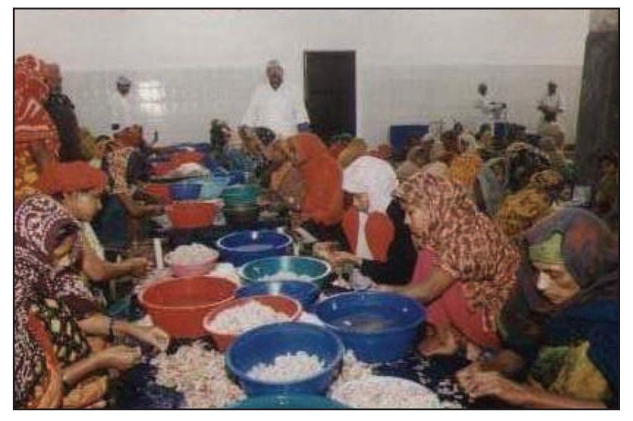
This rare photo inside a Bangladesh shrimp processing factory shows female-workers under the supervision of a largely male managerial force.

Pay rates are further obscured by the issue of long hours. In recent interviews with shrimp processing workers, nearly every worker stated the same thing: "I work from 8:00 a.m. to 8:00 p.m."