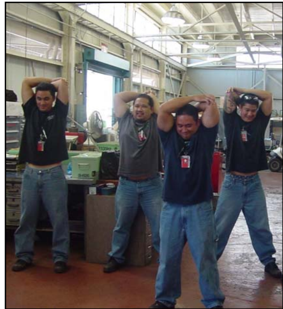
PHNSY & IMF invested in an ergonomics program that includes an employee-led "Flex and Stretch" program.