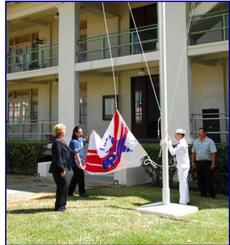
VPP flag is raised at PHNS & IMF on 22 June 2007.