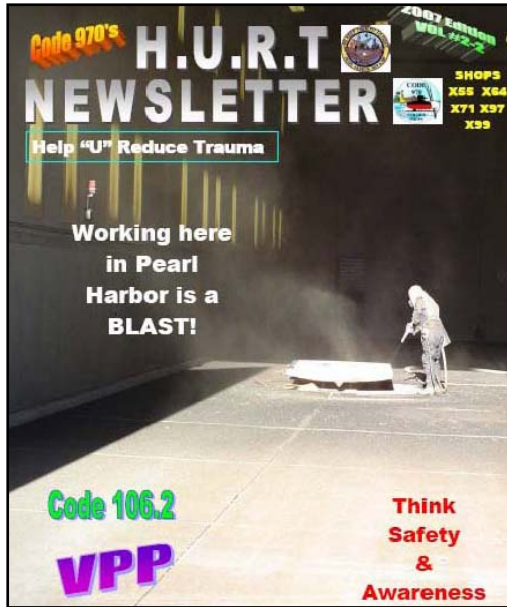
"HURT" [Help U Reduce Trauma] newsletter stimulates employee interest in safety and health.

The Star designation was awarded to PHNSY & IMF after a 10-person OSHA team, from six different regions, conducted a weeklong on-site review of the PHNSY & IMF VPP application and the command's safety and health programs. The on-site review also included interviews with employees and contractors, and a complete tour of the PHNSY & IMF worksites. The evaluation team commended several best practices, including cleanliness of shops and dry docks, bicycle safety, shop safety, health bulletins and newsletters, an Ergonomics "Flex and Stretch" Program, and the VPP Passport (an incentive program for individual employees).