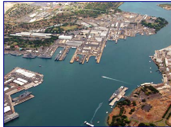
Aerial view of Pearl Harbor Naval Shipyard and Intermediate Maintenance Facility

The command's 112 acre facility includes 114 buildings and structures and four dry docks, many categorized as historic. PHNSY & IMF carries on its proud tradition of service to the fleet, supporting some 30 ships home ported in Pearl Harbor, as well as fleet units that stop there while transiting the Pacific.