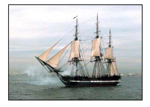
USS Constitution - "Old Ironsides"

Today, PNS is a Naval Sea Systems Command (NAVSEA) shipyard that rapidly turns around submarines that go there for repair, overhaul, or modernization. Shipyard employees work on everything