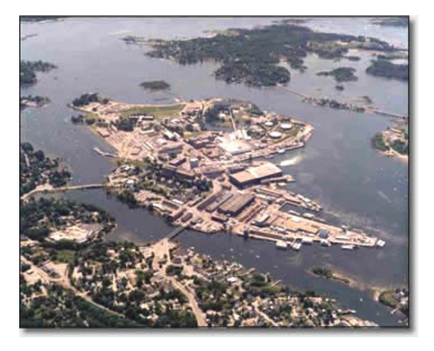
Aerial view of Portsmouth Naval Shipyard