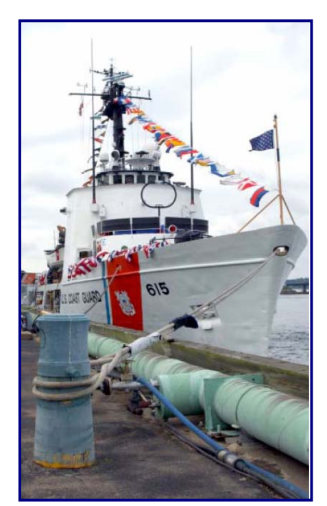
PNS provides homeport support for Coast Guard Cutters.

employers have exceptional management systems and programs that prevent occupational injuries and illnesses. A designated Star site must have had all of its occupational safety and health program elements operating effectively for at least one year, and its injury and accident rates must be below the national average for that industry.