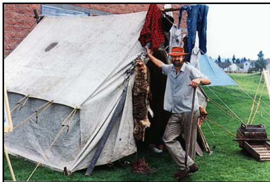
Old time mining camp at pioneer encampment

• Pioneer Encampment. Most of the western United States was originally settled by people involved in natural resource activities—mining, agriculture, and logging. The resource-rich West attracted hundreds of thousands of adventurers, creating a legacy of historic tales and characters. The Pioneer Encampment, set up at a local school, uses history to reconnect students to the area and its natural resources heritage. Gold panning and a mining camp are very popular attractions for students and adults.