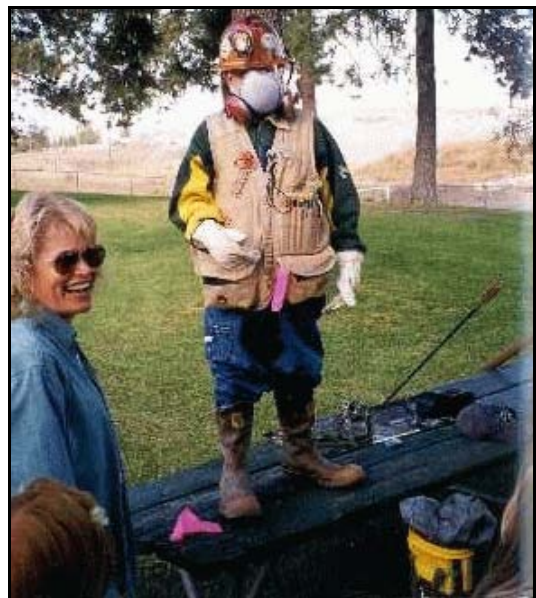
"Munchkin miner" at Model Mine