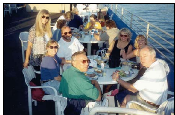
NMEC dinner cruise

NMEC has changed and grown over the years, but it remains the only primary opportunity for people involved in minerals education to come together to discuss their successes and challenges, to meet others involved in similar work, to re-energize their efforts, and to get new ideas about how to improve their programs. There are many teachers workshops every year, but only one conference for those who teach the teachers. This is an