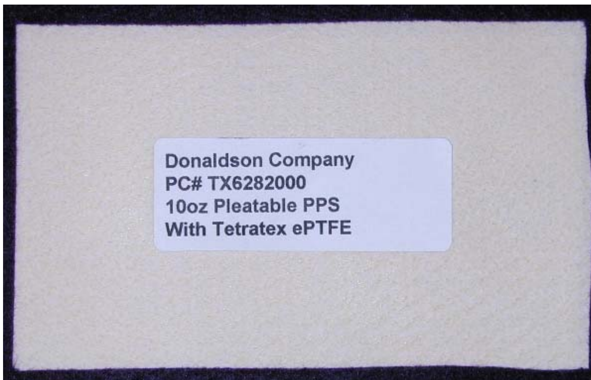
Figure 1. Photograph of Donaldson Company, Inc.'s 6282 Filtration Media