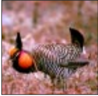
Prairie chicken