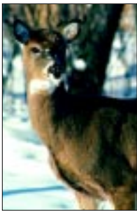
Whitetail deer