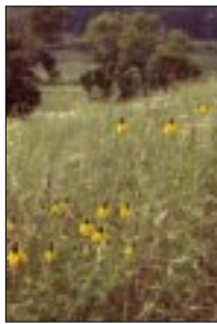
River terrace prairie, C. Blacklock