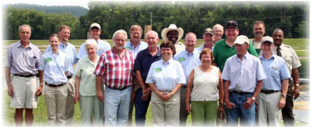
-USFWS Genoa National Fish Hatchery alumni and current staff pose for a picture during the 75th anniversary celebration.

Thanks to all the many planners and staff for their assistance in making this day special. In an effort to help future generations of hatchery employees, the mementos from the day are being placed in a special time capsule so that future generations can plan for their 150th anniversary!