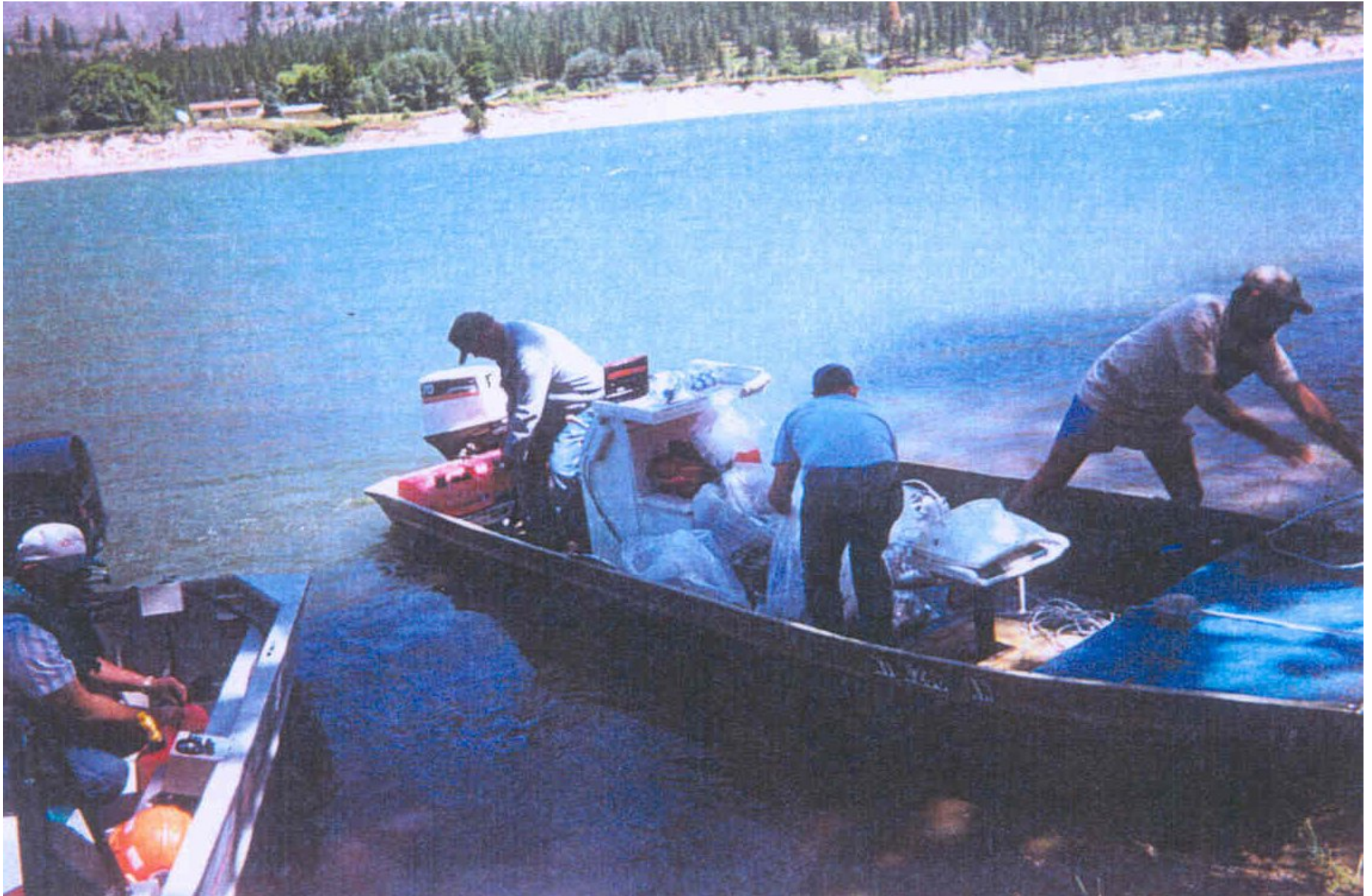
Cleanup activities at the mouth of Thompson Falls Dam.