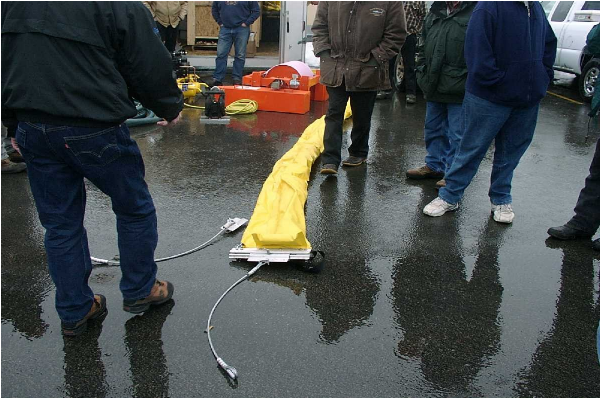
Training on boom deployment.