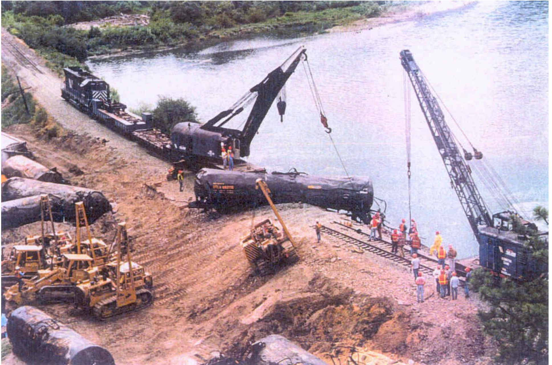
Removal of one of the asphalt cars from the Clark Fork River.