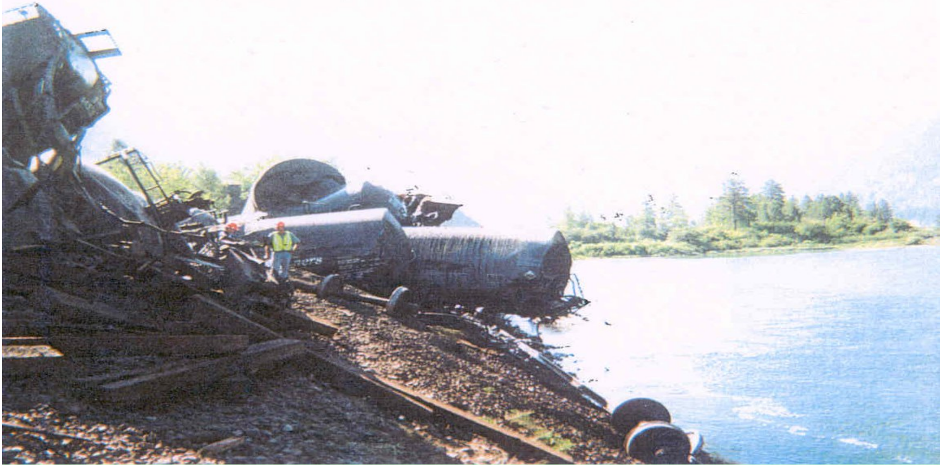
Crew assessing damage of the derailment.