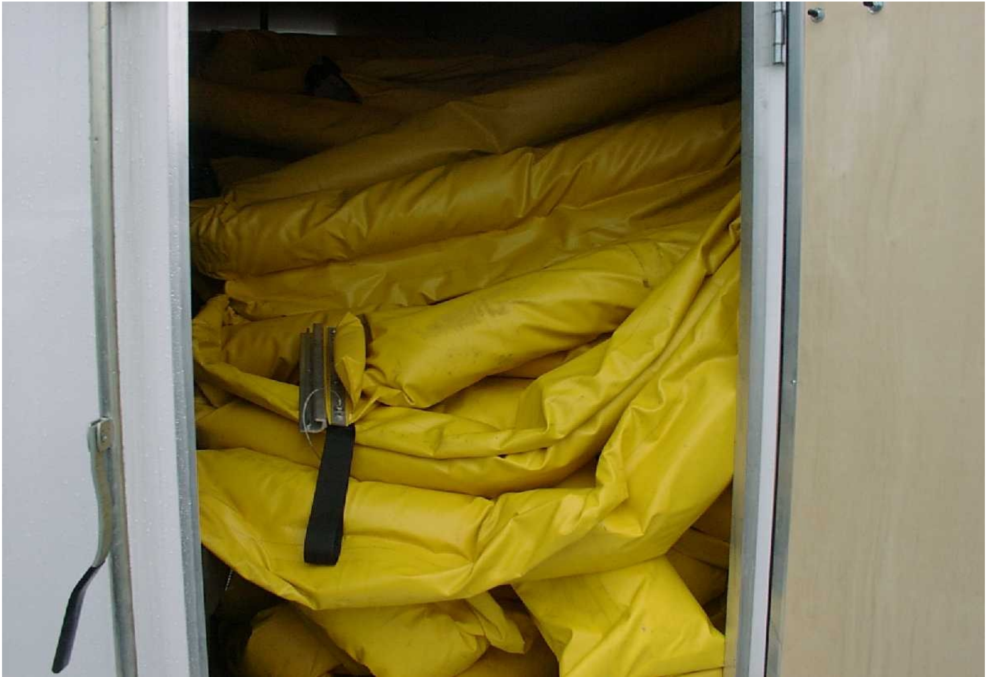
Boom stored in response trailer.