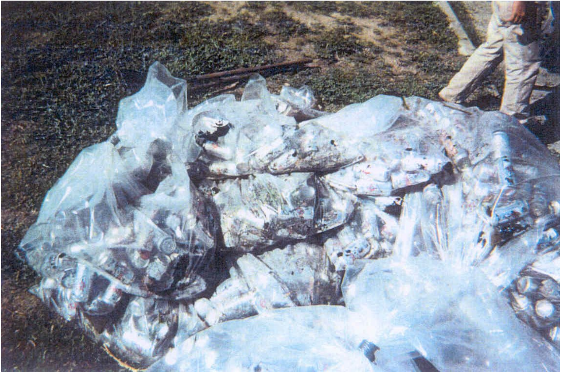
Beer cans contaminated with asphalt collected near Thompson Falls Dam.