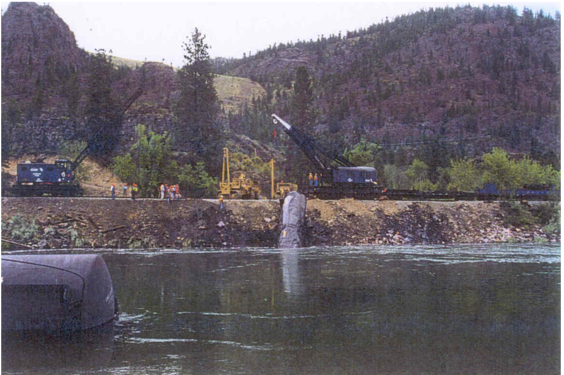
Removal of asphalt car from Clark Fork River.