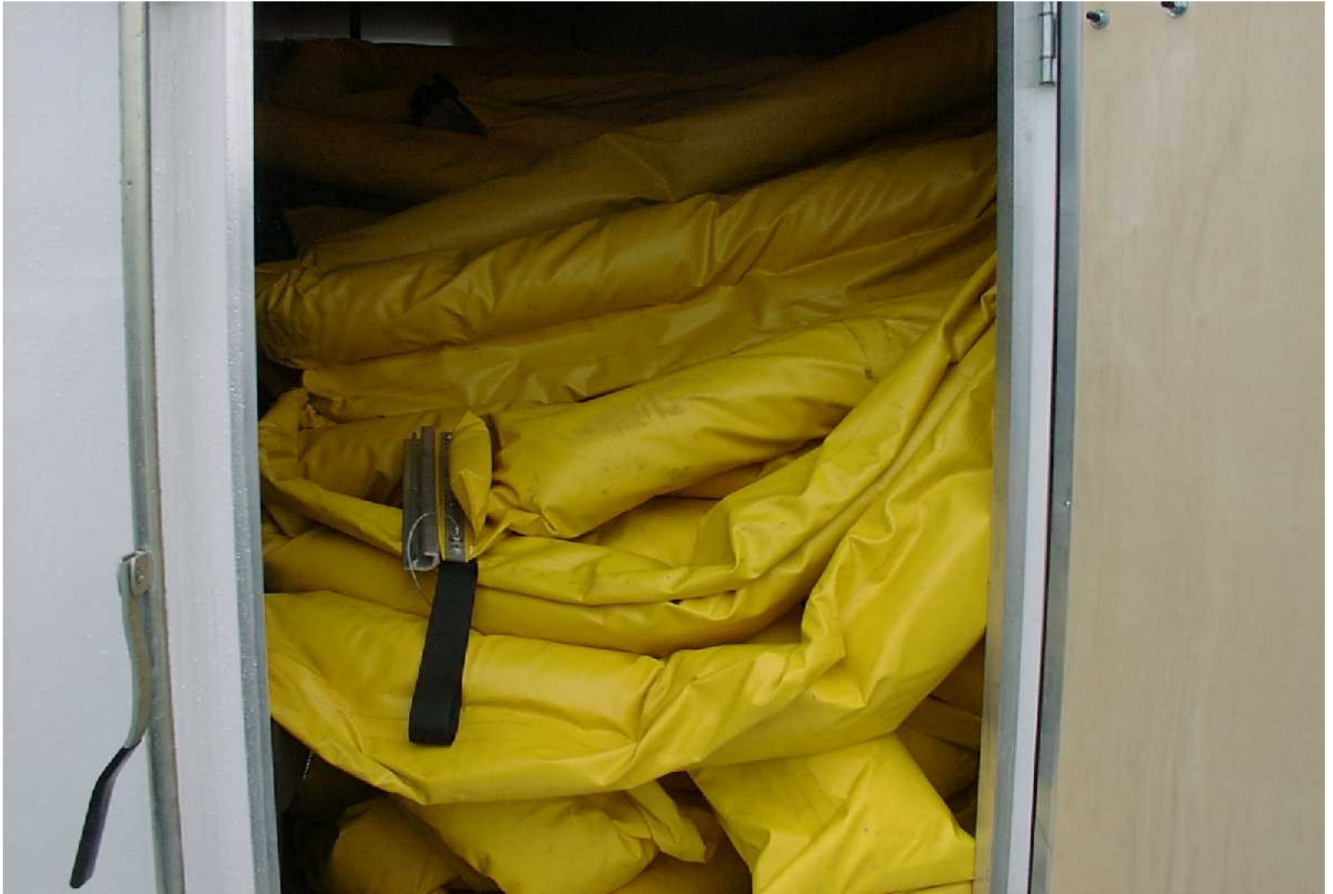
Boom in Response Truck.