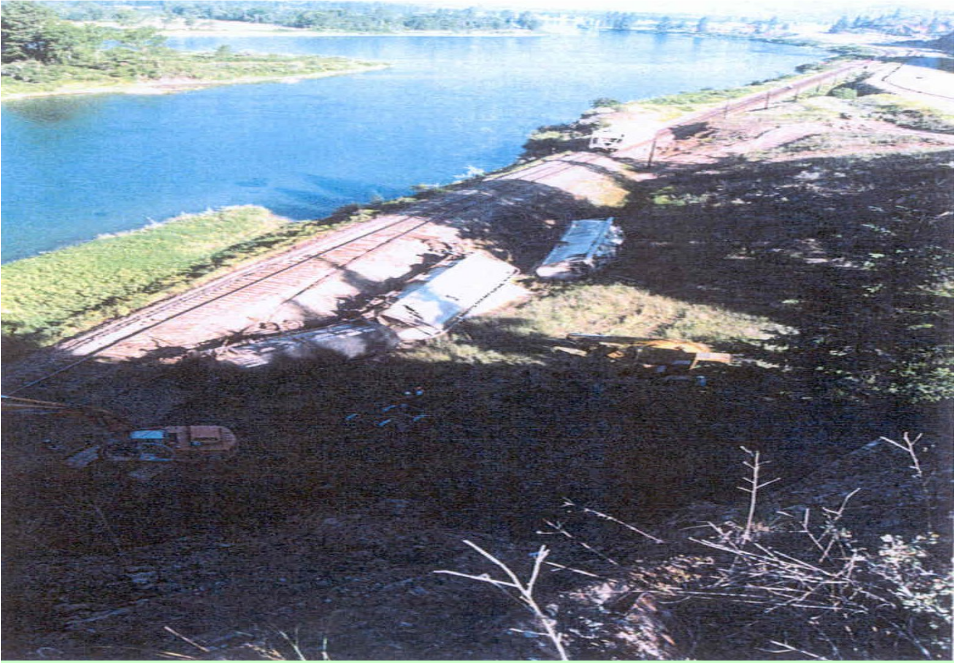
Rail cars derailed all along the tract which is parallel to the Clark Fork River.