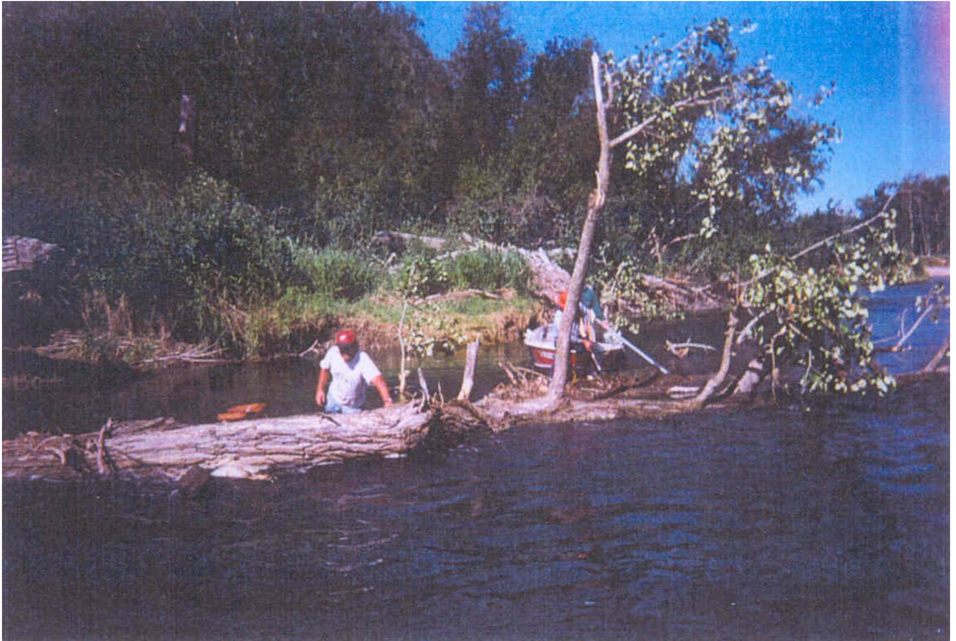
Crews collection asphalt contamination along the shore.