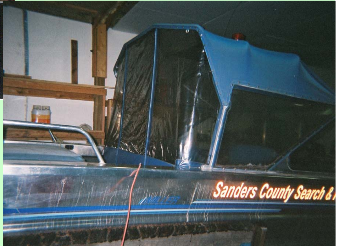
Jetboat purchased with SEP funds.