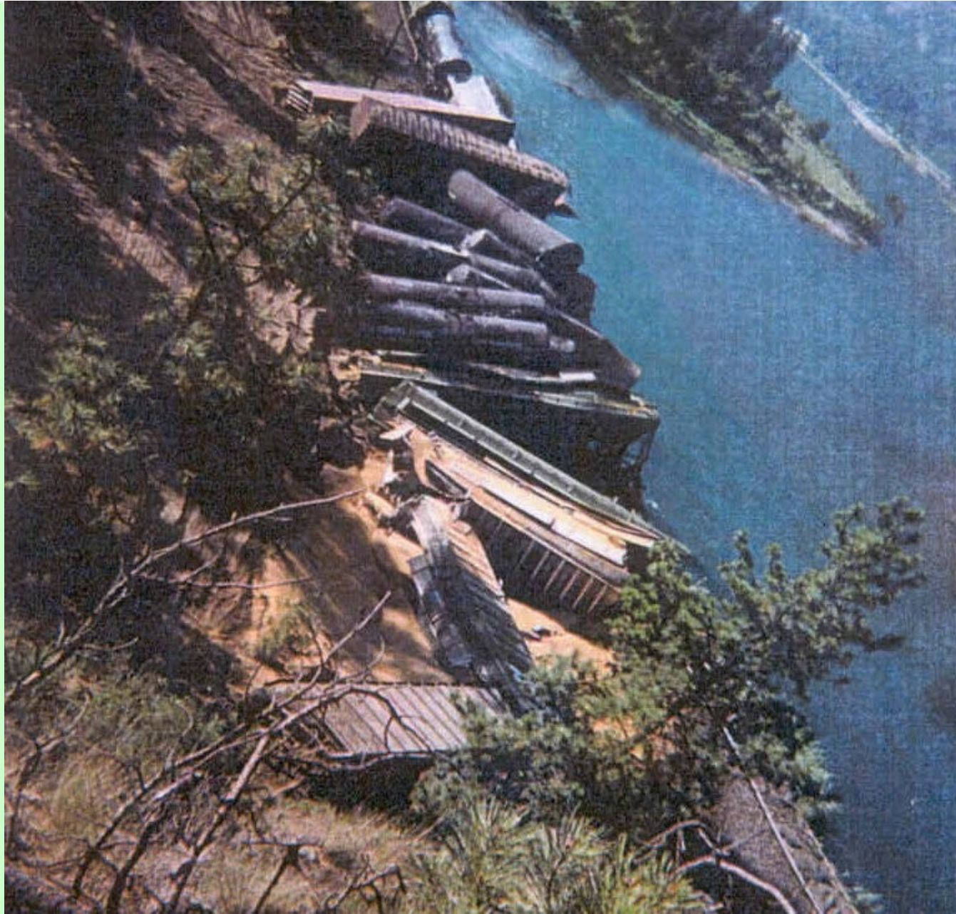
Train derailment as seen from cliff overlooking the Clark Fork River