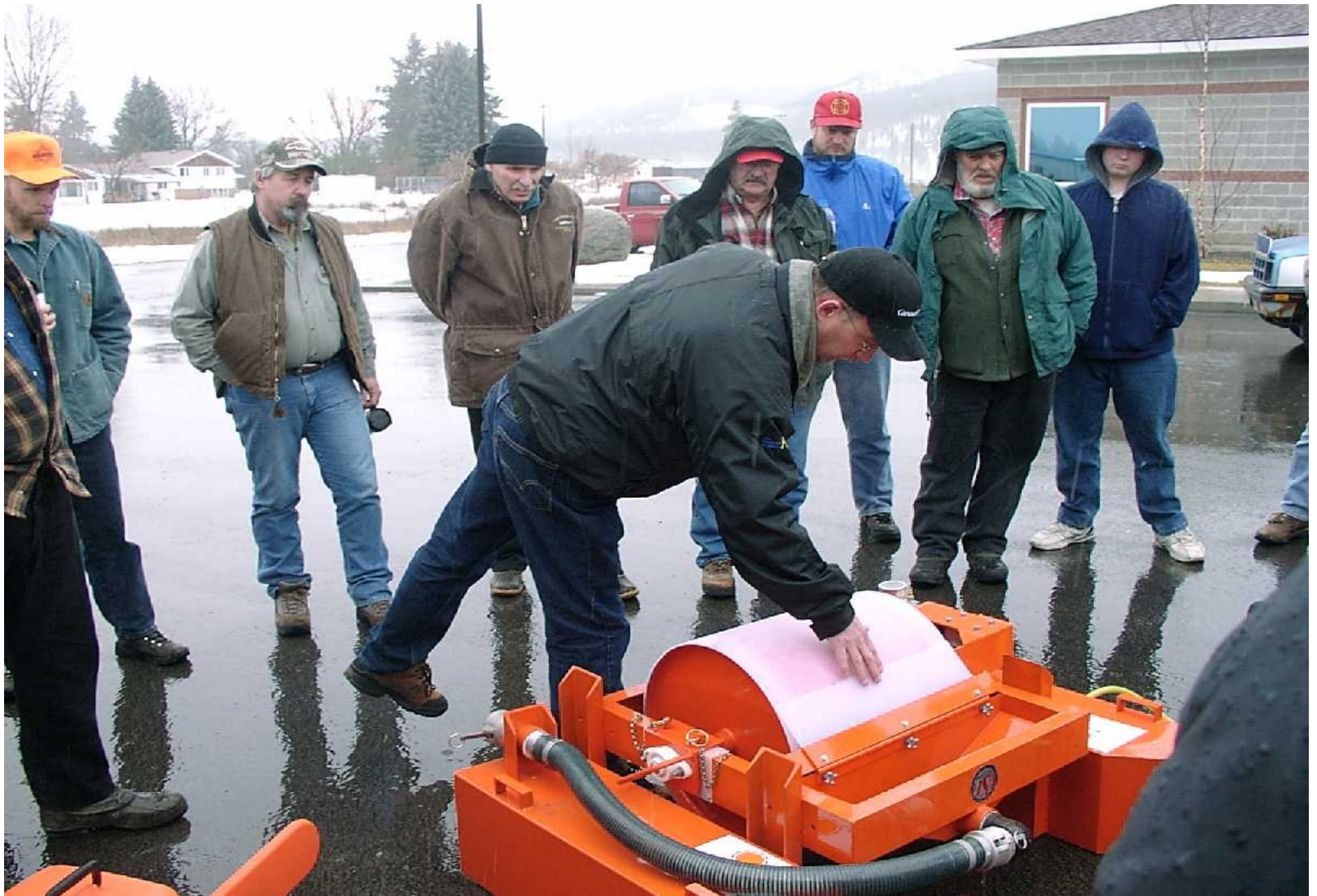
Local emergency responders receiving training on equipment.