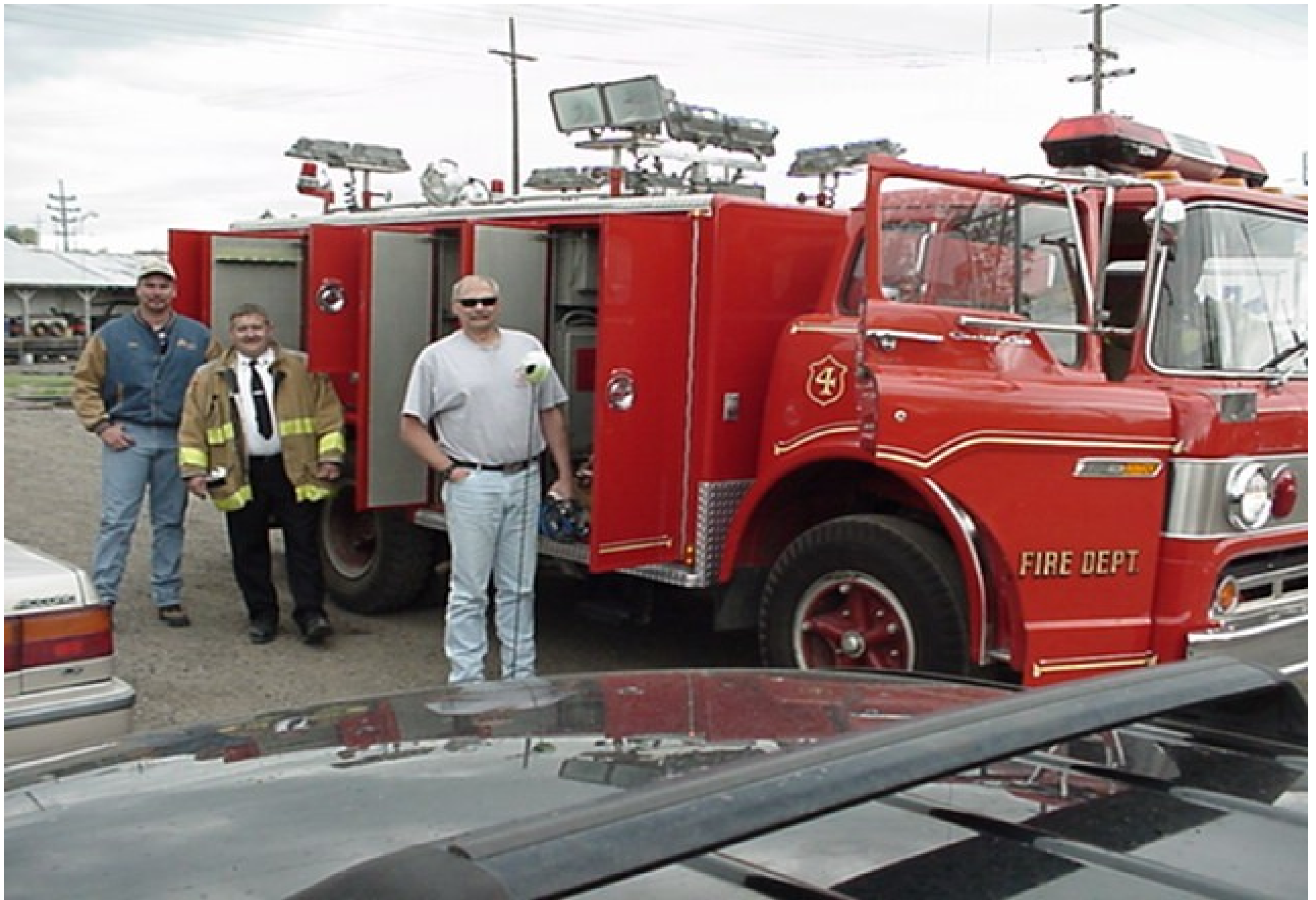
Response truck purchased with SEP funds.