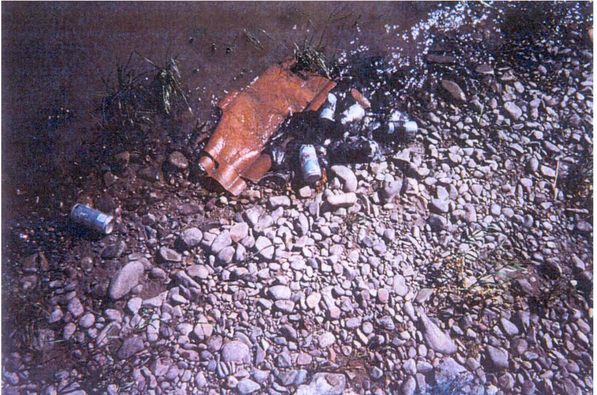
Typical asphalt contamination downstream of the derailment site.