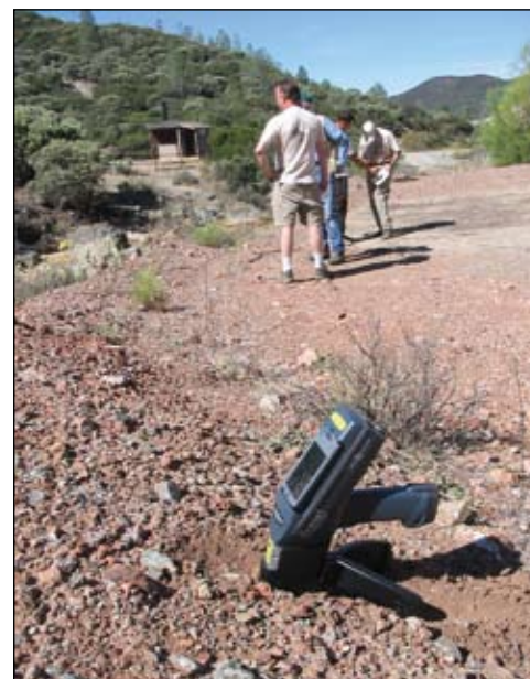
Innov-X XRF in situ measurement

achieve >0.9 on intrusive sampling for many target elements such as arsenic, lead, copper, and zinc. It is essential that Method 6200 be used for removal or remedial action to provide legally defensible data.