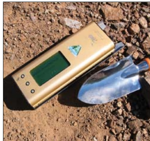
NITON XRF in situ measurement

The NSTC has used this technology at many Hazmat and AML sites, including wire burns, waste dumps, shooting ranges, and virtually all types of AML sites. The Environmental Protection Agency has established Method 6200, which specifies accepted quality assurance-quality control and sampling procedures for using XRF technology. These procedures typically include the use of blanks, certified standards, precision samples, and laboratory confirmation split samples. Laboratory split samples are compared to XRF results by using linear regression, and the regression coefficient and slope bias are compared to acceptable ranges published in Method 6200. Regression coefficients of >0.7 are considered screening data and >0.9 are considered definitive data. It is typical to