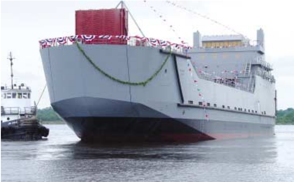
Above: The newly christened Major General Robert Smalls takes to the water. Below: Smalls, circa 1862.