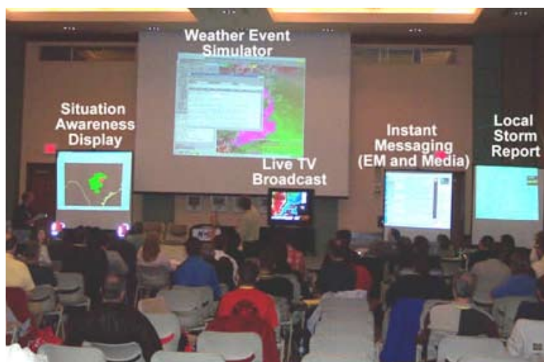
Mock WFO set-up at the National Severe Weather Workshop. This group issued warnings and advisories using the Weather Event Simulator and communicated with emergency managers and media.

The 9th Annual National Severe Weather Workshop will likely take place in early March of 2009. Stay tuned for details. ✱