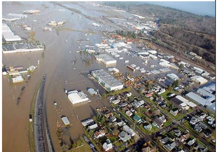
Looking north over Interstate 5 near Chehalis, WA, shortly after the December 1-3, 2007, storms.

The Pacific Northwest is no stranger to strong winter storms with high winds and flooding; however, the storms of December 1-3, 2007, were unusually intense and caused problems even long-term residents had not experienced.