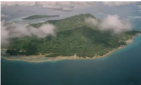
Figure 1. Tonowas Island, one of the many high islands in Chuuk Lagoon.

By Chip Guard, WCM, NWS Guam Chip.Guard@noaa.gov