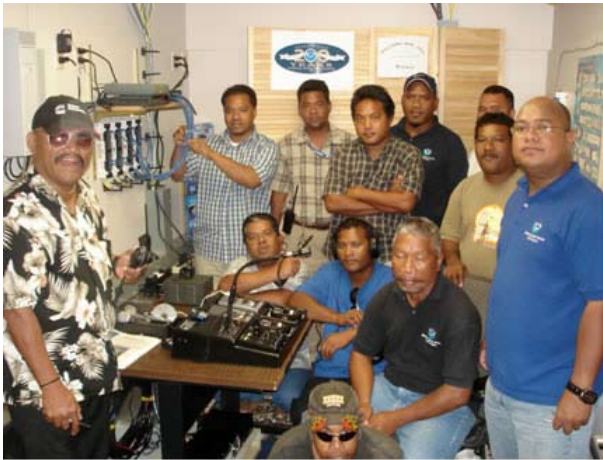
Figure 3. Staff at the FM radio station set up at WSO Majuro receive training for the new FM station. Broadcasts can be produced in real time or prerecorded on cassette tape or CD-ROM.

March 2008. The range of the broadcast is about 30 miles. Each day, the WFO Guam forecast products for specific locations are transmitted on the radio by the WSO personnel; broadcasts are in English and in the local language. Users can receive the weather broadcasts on boom boxes, transistor radios and car radios, effectively reaching a much larger listening community day and night.