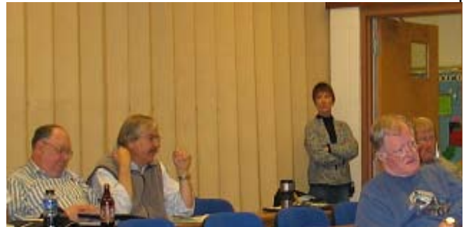
The third annual Eastern Montana Disaster and Emergency Service Workshop featured a new feedback/listening session in addition to numerous disaster awareness presentations.