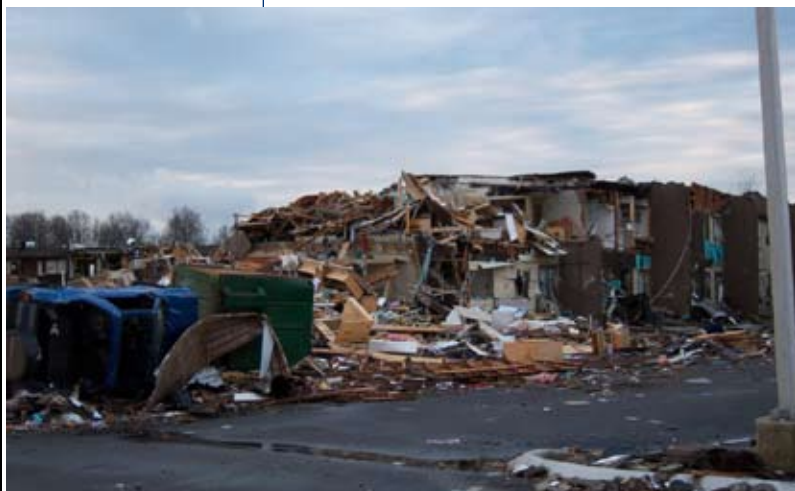
Damage from an EF-4 tornado which hit Union University in Jackson, TN. There were no fatalities and only minor injuries due to timely warnings from the NWS and proactive preparedness actions by the university.

The teams have also identified best practices for other NWS offices to emulate during similar severe weather events. The team assessment reports are expected to be released this summer and early fall 2008. Check the summer edition of Aware for the link. ❄