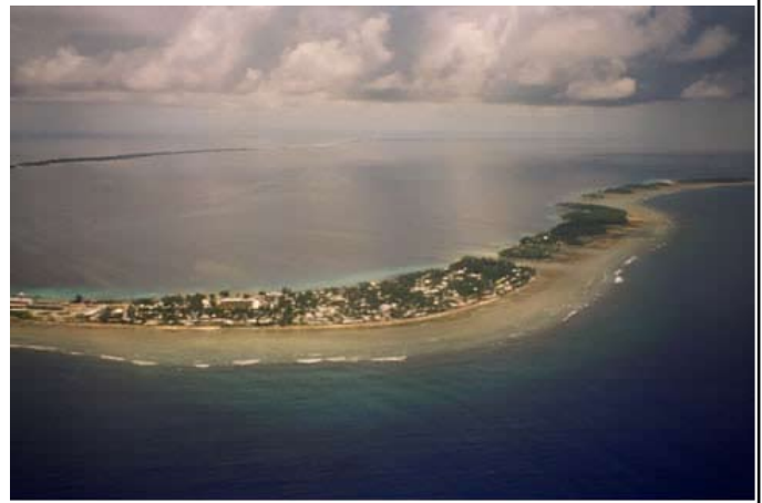
Figure 2. Part of Majuro Atoll in the Republic of the Marshall Islands. The elevation of this islet is only around 7 feet above sea level.

The system in Chuuk has been operating successfully for several months; the Majuro system was installed in late