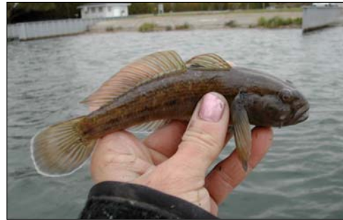
Bottom trawling surveillance efforts detected a new population of round goby in the Cheboygan River in 2002.