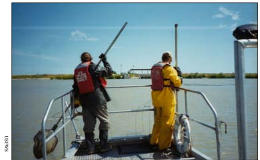
Fish use of the restored coastal wetland at Metzger Marsh on the Ottawa NWR was documented with daytime and nighttime electrofishing.