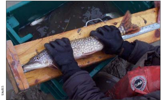
Data is collected on northern pike at the Shiawassee NWR to assess their reproduction in wetlands on the refuge.