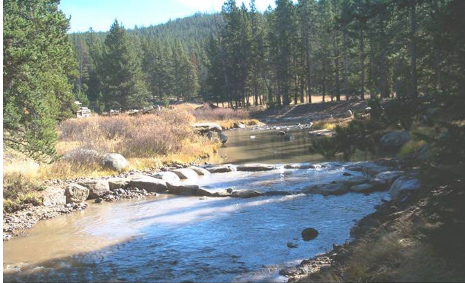
Fig. 5: After Construction

The Dead Swede Channel Stabilization Project was completed in two phases: plan design and project construction. Steady Stream Hydrology, Inc. of Sheridan, WY was awarded the contract for the project's plan design phase and Garber Agri-Business, Inc. of Big Horn, WY was awarded the contract for the project's construction phase. Construction was completed in October, 2003 under the supervision of U.S. Forest Service and Steady Stream Hydrology employees. Future monitoring of the project will include observation of changes in fish populations, increased vegetation in the flood prone area, and reduction of streambank erosion.