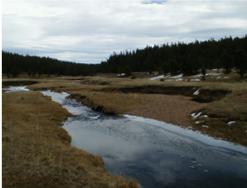
Fig. 2: West Fork of South Tongue River

Figure 3 shows an area where the South Tongue River was encroaching on the Dead Swede Campground, prior to stabilization of streambanks. The left bank (background of photo) was vertical and constantly eroding every year. Figure 4 shows the same area after construction and stabilization of its streambanks after which the vertical bank was sloped back and a flood prone area was created.