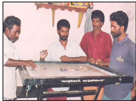
Indian truck drivers learn about HIV prevention at social centers.