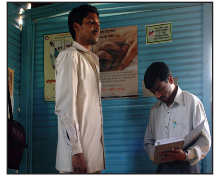
A community health worker provides home-based care to a client.

PEPFAR assists efforts to pioneer a new comprehensive care model, through which people living with HIV/AIDS and their families are provided with improved health care, prevention services, and psychosocial and economic support. Since the project began in 2001, it has registered 6,028 people living with HIV/AIDS, of whom 513 are children, with the goal of improving the quality of life for these individuals and their families. Reaching into the community, the project has established and trained a cadre of community members, many of whom are HIV-positive themselves, to serve as “peer” community health workers. Community health workers provide critical information on counseling, treatment of opportunistic infections, and antiretroviral treatment. This program highlights the important role that trained community health workers play in HIV prevention and care for people living with HIV/AIDS.