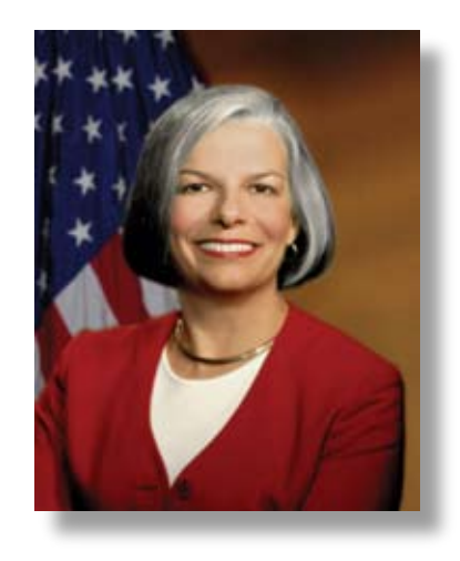
Director, National Center for Injury Prevention and Control