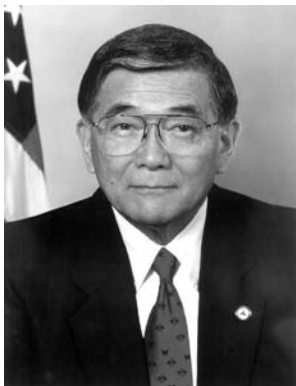
Norman Y. Mineta Secretary of Transportation U.S. Department of Transportation May 2005

Remember that while our rules’ primary purpose is deterrence, they also create prevention and treatment opportunities for workers struggling with drugs and alcohol. Anyone who violates DOT rules is required to undergo evaluation and treatment, and that person is not allowed to return to duty until treatment is successful and a follow-up testing plan is in place. The Department is proud that our rules work to help people combat abuse and addiction. Inside these pages is also information on where to go for substance abuse assistance.