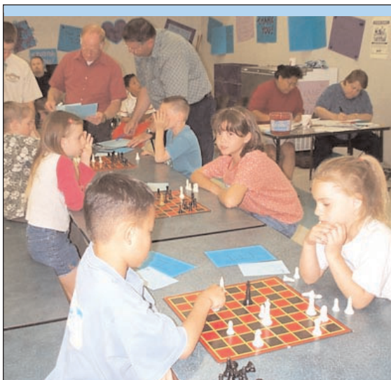
The Brentwood Elementary School Chess Club.

Although the student population and consequently the teacher population has grown rapidly, the school's philosophy has remained the same—"the school staff will do whatever it takes to make the school the best learning environment for each one of our students," the principal said.