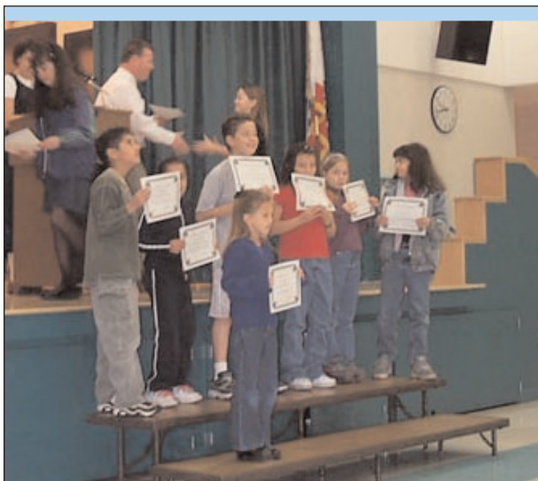
Brentwood Elementary rewards students for good behavior and hard work.

The school rewards students for good behavior and hard work. Students can earn three Brentwood “bucks” daily for accomplishments like good behavior and completing their homework. They can spend these incentive awards in the student store or purchase a lunch date with the principal or permission to supervise the school playground. Student accounts are maintained in an electronic database and operated with the assistance of the student senate. In addition to the student senate, the school also gives students opportunities to lead through projects like the student store (student-run), and student authors (where students are recognized for their writing).