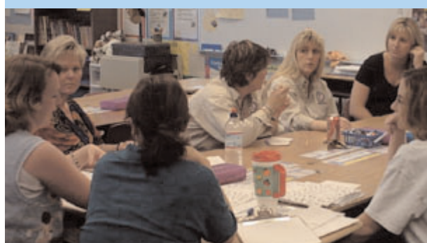
Brentwood’s Friday grade level meetings were quickly recognized as invaluable and scheduled weekly.

The school staff lengthened the school day by 20 minutes Monday through Thursday in order to devote Friday afternoons to grade level teacher planning. Initially biweekly, the Friday grade level meetings were quickly recognized as invaluable and scheduled weekly. Teachers saw this planning time as key to the school’s success; it encourages collaboration among teachers and instructional support staff and fosters planning, instruction, assessment, and support for each student. Grade level teachers meet on Friday afternoons to discuss students’ needs, develop lessons, coordinate projects, generate ideas, review data, and strategize how to best meet individual students’ needs. As a result, teachers are aware of activities in other classrooms and occasionally coordinate activities so that similar assignments are due on the same day.