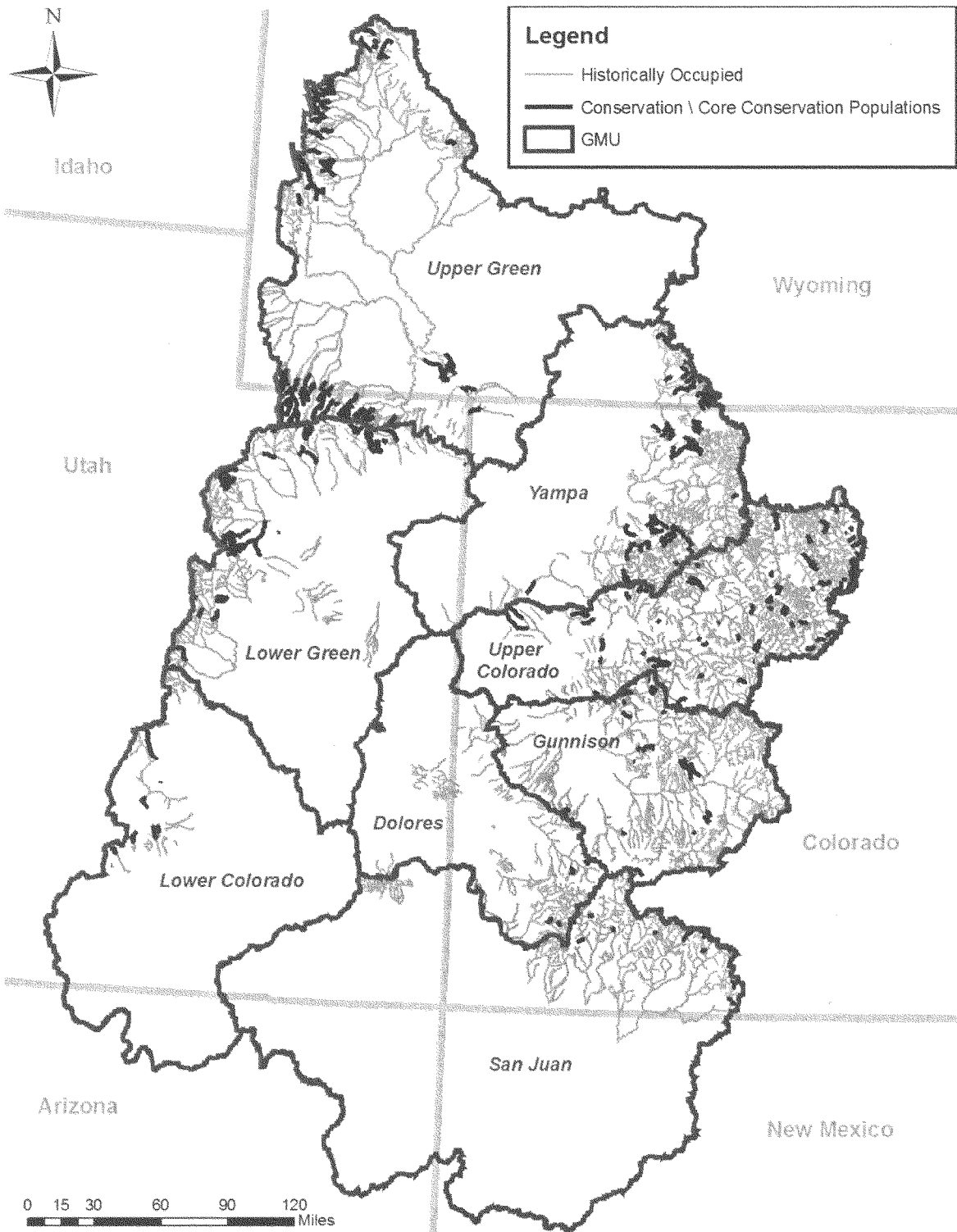
Figure 2. CRCT Conservation Populations