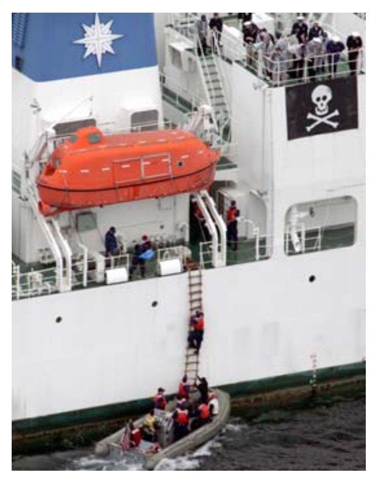
Crew of the USS Vandergrift board a simulated suspicious ship during a multi-national exercise in Sagami Bay, October 26, 2004.