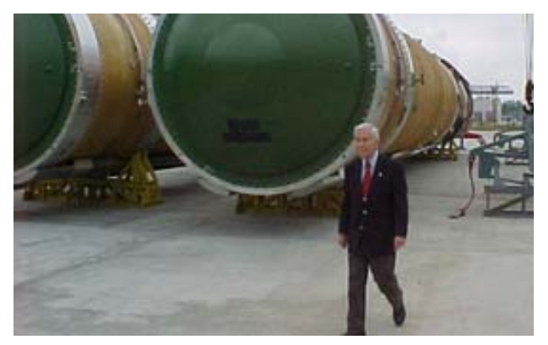
Senator Lugar reviews destruction of Russian SS-18 Missiles.

In addition to the Cooperative Threat Reduction Program under Nunn-Lugar, President Bush has expanded and accelerated the proliferation prevention programs of the Departments of Energy and State. Through these efforts, the U.S. has: